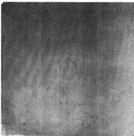
Fig. 3. Magnified part of the filter used

The filter is realized by the technique of LOHMANN [4] using connected cells as proposed by STĘPIEŃ and GAJDA [5] (see Fig. 3).