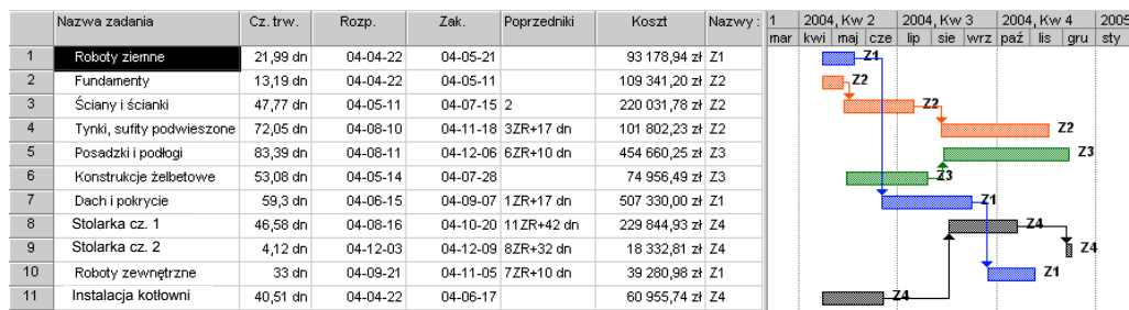
Fig. 3. Material-financial plan for gym in Żarnowiec, taking into account risk conditions.