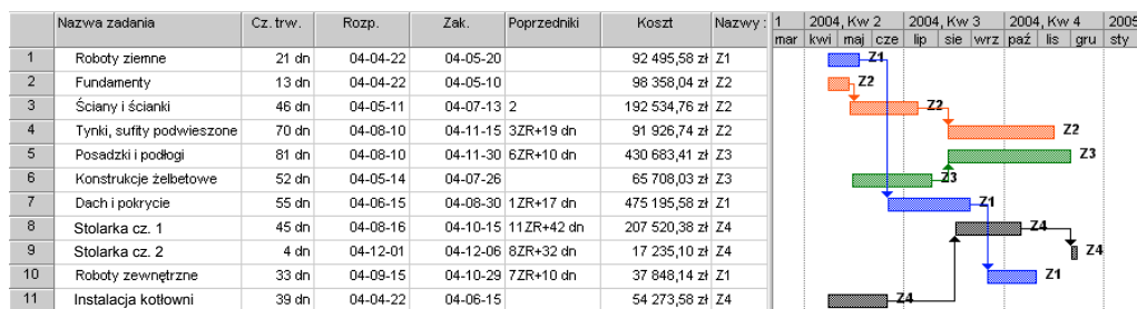
Fig. 2. Deterministic material-financial plan for gym in Żarnowiec.

The figures for particular risk factors represent a subjective opinion, but are based on a thorough analysis carried out by “the tender preparing team” working for the KARTEL construction firm. The analysis preceded project implementation. The aim of the project was to build a gymnasium with an indoor swimming pool at a complex of schools – The Centre of Lifelong Education in Żarnowiec. An excerpt from the original material-financial plan of the project is shown in Figure 2.