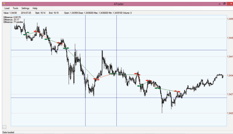
Figure 3. Main panel of a-Trader