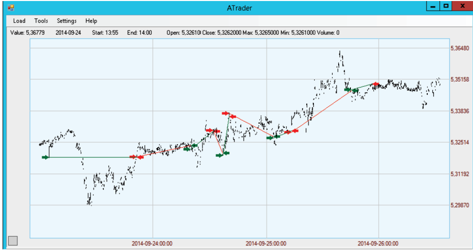
Figure 6. The example of strategy visualization