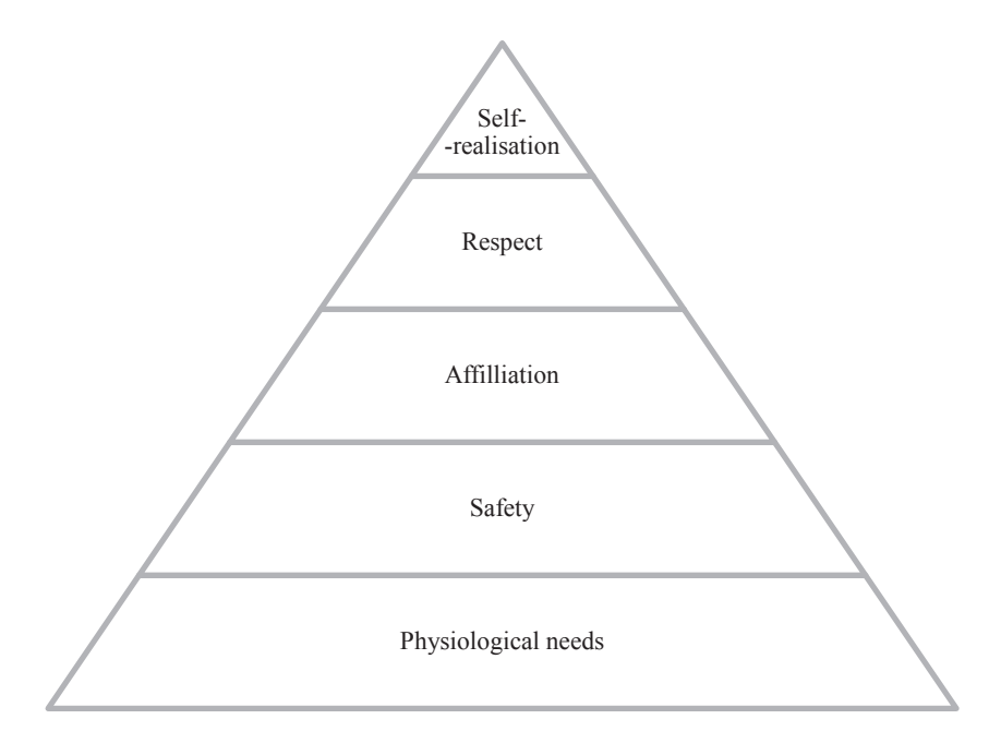
Figure 1. The structure of needs by A. Maslow