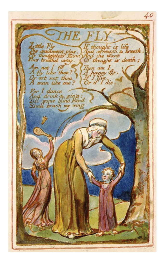
Fig. 7. William Blake, Songs of Innocence and of Experience – The fly, 1789

II. 7. William Blake, Pieśni niewinności i doświadczenia , 1789 (źródło: The William Blake Archive – blakearchive.org)