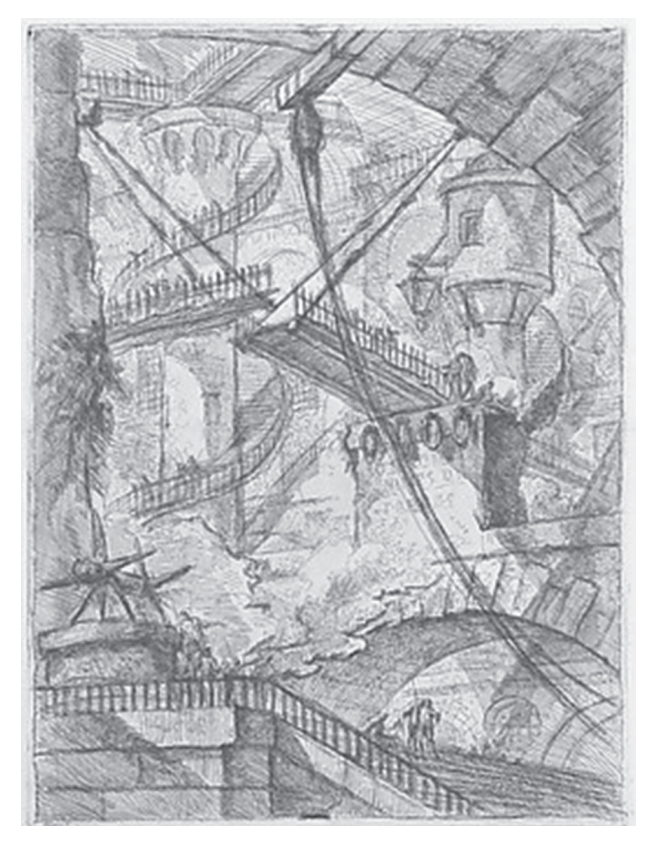
Fig. 4. Giovanni Battista Piranesi, The Drawbridge , 1749–1750

The first three artists selected – Dürer, Piranesi and Goya – present a correlation between their modus ope-randi , even if they are separated by space and time. These three artists conceived of their body of graphic work as an inseparable whole, a single creation with a single theme, the same procedure, and a sequential ordering of the works that led to a reading of the images just as the artist had intended; it should be noted that each of the print were numbered so that their order was always the same, their characteristics coinciding with those identified with the execution of an artist's book in printmaking.