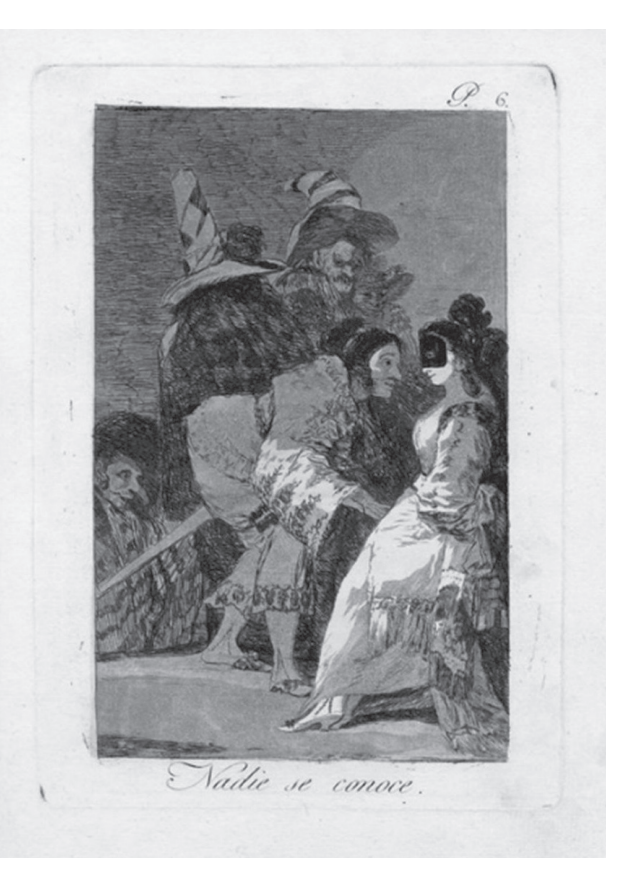
Fig. 6. Francisco de Goya y Lucientes, Los Caprichos nº 6 – Nadie se conoce, 1797–1799

We perfectly understand the transdisciplinary concept when we think about the breakage of the old mercury thermometers, and how the particles of mercury were dispersed in different drops, if we imagine each drop corresponding to a discipline, a fragment of human knowledge. The disciplines grow more and more distanced from each other, but, in reality, they are fragments of the same whole, and, if they are brought closer to each other, they connect once again.