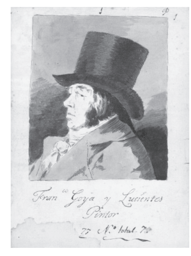
Fig. 5. Francisco de Goya y Lucientes, Los Caprichos nº1 , front page, 1797–1799

II. 5. Francisco de Goya y Lucientes, Kaprysy, nr 1, pierwsza strona, 1797–1799