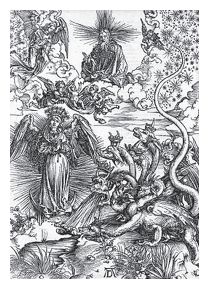
Fig. 2. Albrecht Dürer, The woman of the Apocalypse and the seven-headed dragon (Latin Edition: 1511 – second edition)

Le Carceri d'Invenzione (The Imaginary Prisons), by Giovanni Battista Piranesi (1720–1778), is a collection composed of fourteen etchings, in which Piranesi's rich imagination transformed the architecture of Roman ruins into prisons, as he envisioned the architecture in a dramatic and fantastic way. His training as an architect and predilection for architecture is evident in all his etchings, but it is in this work where Piranesi lets his imagination soar, depicting