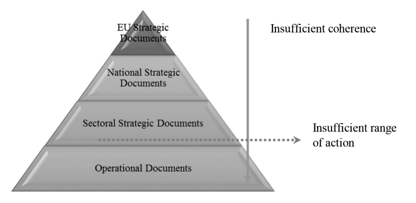
Fig. 2. Horizontal and vertical relationships between documents supporting the development of Industry 4.0

The analysis carried out reveals essential problems related to the adoption and implementation of the strategic and operational actions regarding the "evolution" of Bulgarian industry to "Industry 4.0". The analysis reveals two main problems: a horizontal imbalance and a low degree of vertical subordination of the different strategic and operational documents that should "bring" Bulgarian industry to the next evolutionary stage (Figure 2).