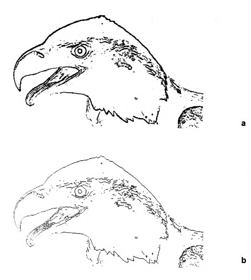
Fig. 4. Initial image (a), processing results (N = 4) (b).

method [4] 90 s, method [5] 60 s, our method 15 s. These results show the method potential.