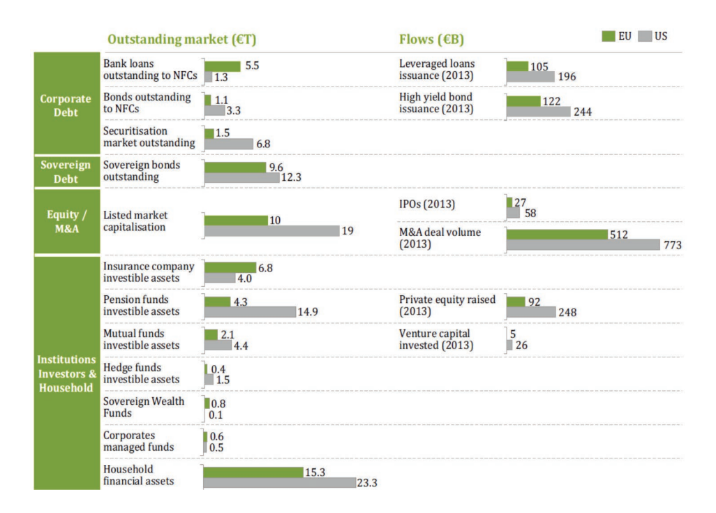
Figure 1. The European Union and the US: different structures and sources of finance