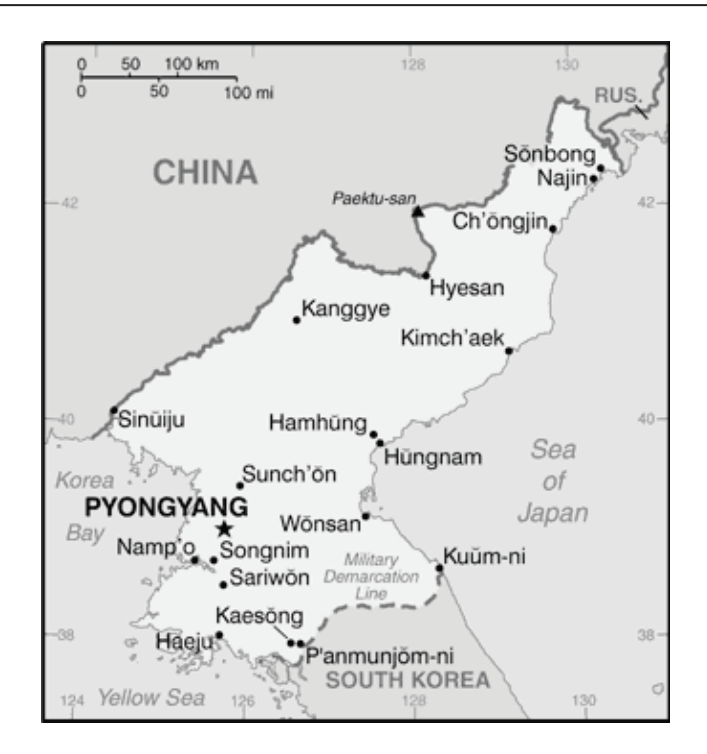
Figure 1. Map of North Korea showing principal Special Economic Zones (Hwanggumphyong-Wihwa Islands located in vicinity of Sinuiju)

DPRK sought to exercise greater control over what vendors could sell in the zone while there were few efforts undertaken to coordinate the development with China and Russia.