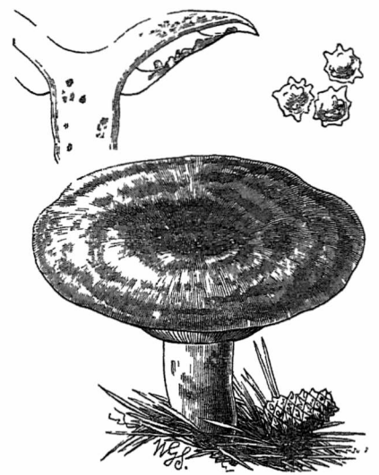
Fig. 1 — Lactarius deliciosus (Orange-milk Mushroom). Under fir-trees, in autumn, colour, brown-orange milk at first orange, then green diameter, a to 10 inches.

With the ordinary meadow mushroon (A. campestris) and its near relative the horse mushroon (A. arvensis), every one is familiar, and both of them have occurred in profusion this autumn. Against the latter an unfounded prejudice prevails in some districts, but its larger size and coarser texture require only a little extra cooking to develop the flavour and correct indigestibility. In spite of all that has been said to the contrary, we maintain that these agarics are entitled to the first place, and for the second much rivalry exists between the orange-milk mushroom (Lactarius deliciosus) and the Parasol Agaric (Agaricus procerus). Both are readily distinguishable, and may be eaten with equal impunity. The former is chiefly found in plantations of Scotch fil and larch, is of an orange-brown colour, and firm flesh, and yields, when bruised, an exudation of orange-red milk, which turns green after a few minutes' exposure. The latter is common in pastures, and may be recognised by its tall habit, the stalk gradually enlarging at the base, the umbo of a brownish colour with spots or patches, and the gills white and unconnected with the stem. The plum