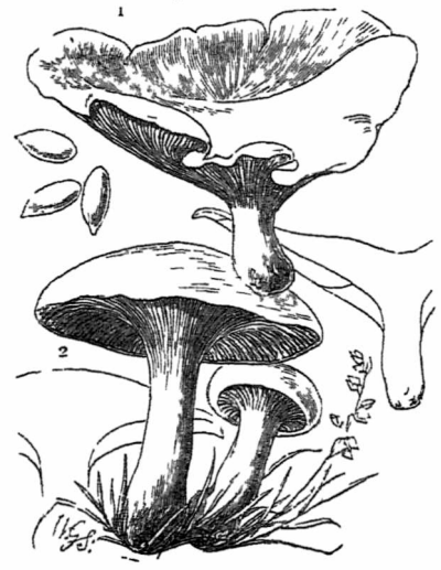
Fig. 3.—'1) Agaricus orcella and (2) Agaricus prunulus (Plum Mushroom Woody places, in autumn, colour, snow white, wi h pale rose gills; diameter, 2 to 4 inches

One caution must be added. All agarics are more wholesome fresh than stale, and with some the neglect of this rule may lead to unpleasant consequences. It is rigidly enforced in the Roman market, where all specimens which are "muffi, guasti," or "verminost" are seized and thrown into the Tiber, and it should be distinctly understood in every English kitchen into which even the common mushroom is allowed to enter. The fungus which to-day successfully simulates a sweetbread, may to-morrow simulate with equal success a handful of snuff.