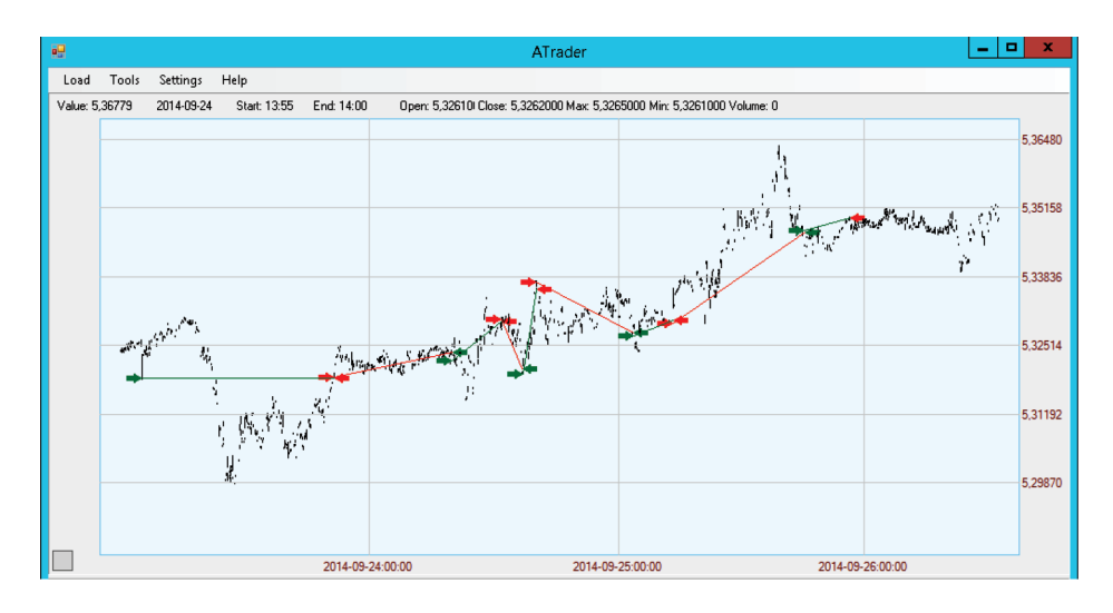
Figure 6. The example of strategy visualization