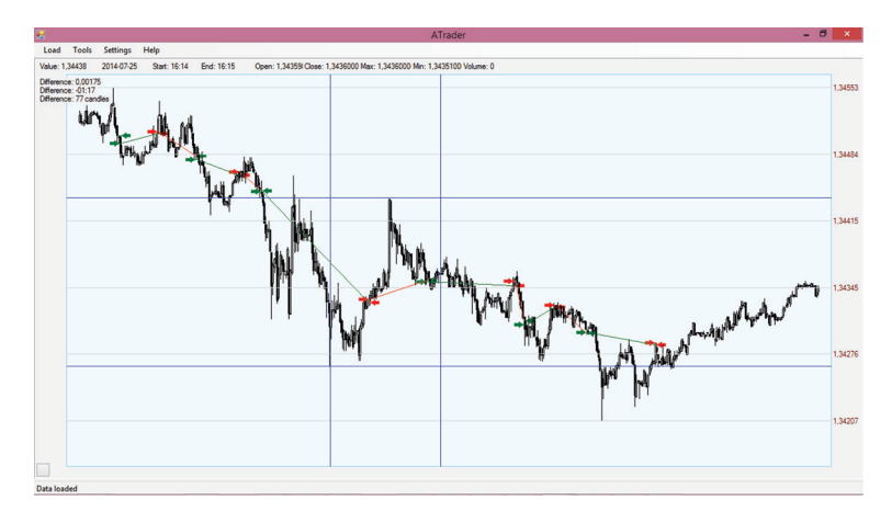
Figure 3. Main panel of a-Trader