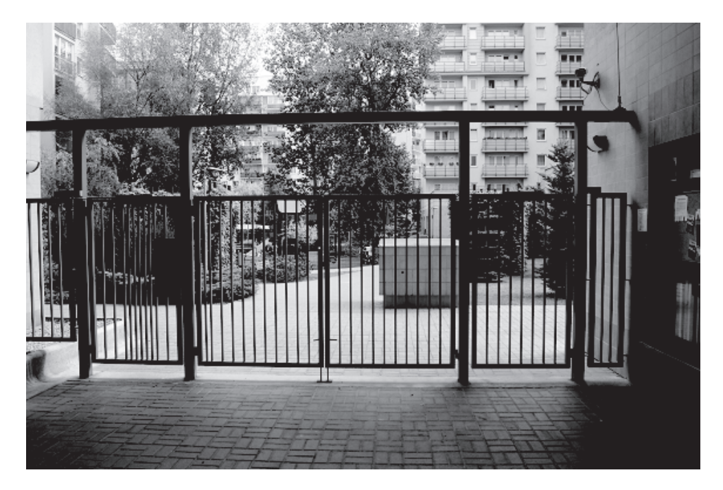
Figure 2. Closed housing development in Warsaw