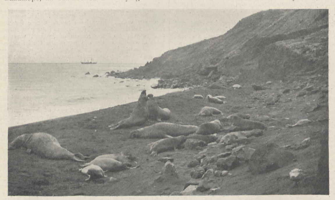
Fig. 1.—View of north end of elephant seal rockery, Guadalupe Island. Males, females, two-year olds and yearlings. The males with heads erected are in fighting attitude, with proboscis retracted and mouth wide open. U.S.S. Albatross in distance.

The skin of the adult male is very thick, and the