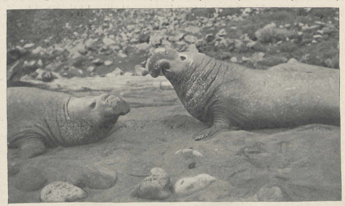
Fig. 2.-Male elephant seals approaching to fight. When within striking distance, both rear high on fore flippers, retract proboscis and open

At the beginning of the Senonian were slight and local volcanic outbreaks, and this formation is sometimes bituminous. Marine deposits of Eocene age are first seen on the west side of the Jordan about the latitude of Jaffa, and become more extensive in proceeding northward. No marine beds of Miocene or Pliocene age occur in the hill country; the deposits in the Jordan valley are