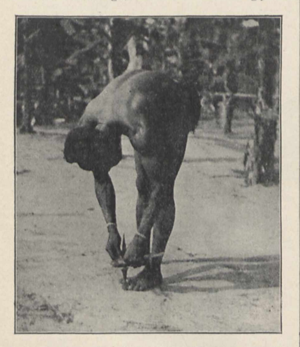
FIG. 2.—An Akela cutting up his food. From "Land and Peoples of the Kasaı."

The Basonge, the Batetela (and their love of painting pictures and use of signalling gongs), the Bakongo of Central Africa (not to be confused with the quite distinct Bakongo of western Congoland), the cannibal Bankutu, the Batwa dwarfs, the Batende, Babunda, Baluba, Basongomeno, and, above all, the aristocratic Bushongo, are most interestingly de-