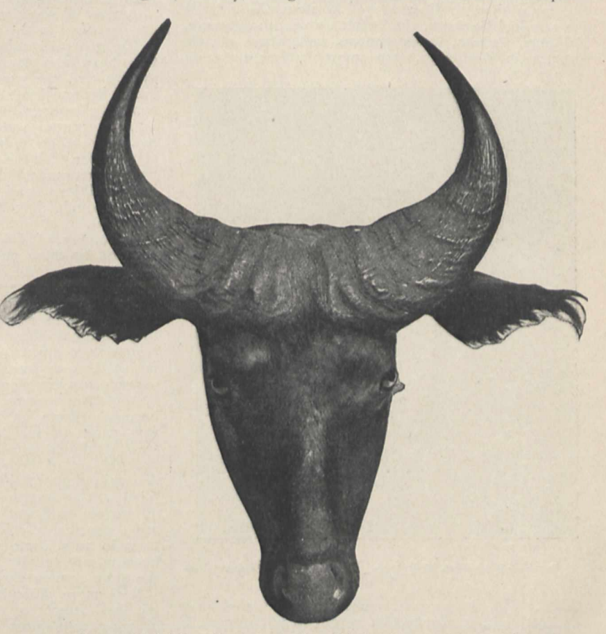
FIG. 1.-Head of Bos caffer simpsoni. From "Land and Peoples of the Kasai."

railway and steamer to the Kasai. This river at once contrasted with the main Congo by "simply teeming with hippopotami, crocodiles, and innumerable varieties of aquatic and other birds"; for owing to some unexplained reason the destruction of animal life along its banks had been very little compared with the devastation which has fallen on the main Congo through the acquisition of guns by the natives and the thirst for killing which has so long animated all white pioneers, settlers, and steamer passengers in that region. An interesting description is given of the headquarters of the Kasai Company at Dima, near the confluence between the Kasai and the Kwango (the Kwango was the first of the great Congo tributaries which entered into history, and was reached by the Portuguese as early as the seventeenth century, though its lower course remained unexplored