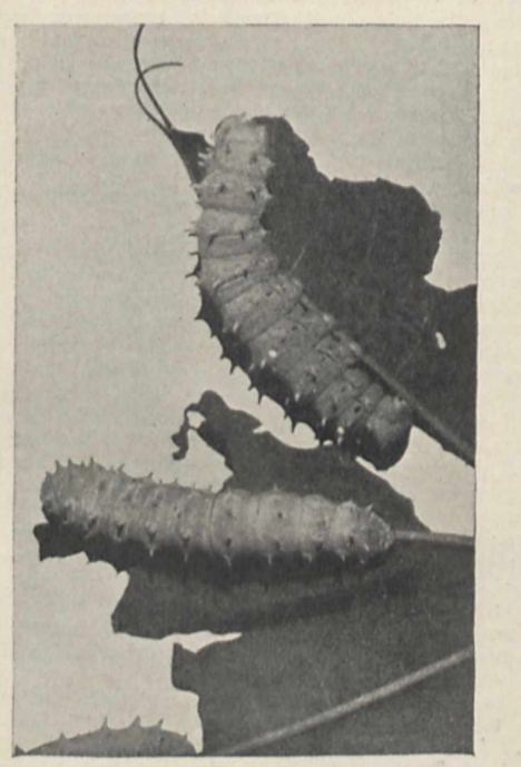
FIG. 2.-Eri silkworms ready to spin : half natural size.

The castor-oil plant grows wild in the Philippines, and this silkworm is more easy to rear, and requires less care