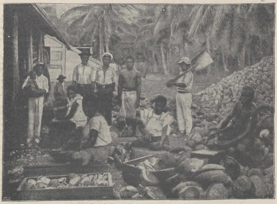
Making Copra in Samoa. From "Agriculture in the Tropics."

Part iii., on "Agriculture in the Tropics (General)," and part iv., on the "Organisation of Agriculture," are distinctly interesting and valuable. They present the chief economic problems, including agricultural education and cooperative movements, with which the planters, administrative officers, and others have to deal, and suggest general lines along which the development of a tropical agricultural country should proceed to secure the best permanent advantage to both peasant and capitalist planter. These sections are well worth the careful study of all engaged in practically dealing with, or merely interested in, the broad administrative problems of the tropics. Such study should prevent much loss of time and money from misdirected efforts,