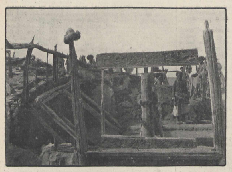
Fig. 1.-Hall of Ancient Dwelling (Third Century A.D.) after Excavation, Niya Site.

THE detailed results of Dr. Stein's latest achievement in the world of scientific exploration are awaited with the deepest interest by all who concern themselves with the problems of Asiatic research, and