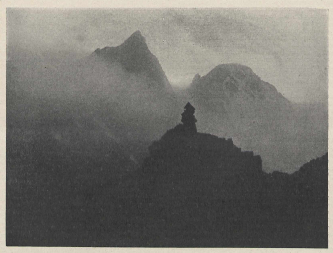
The Urtind at Midnight. In the background the Faestning and Kjostind. From "Mountaineering in the Land of the Midnight Sun."

A NATIONAL SCHEME OF AFFORESTATION. THE Royal Commission on Coast Erosion and Afforestation has issued its second report, which deals with afforestation. If the scheme proposed in this report be adopted, it would mean that in eighty