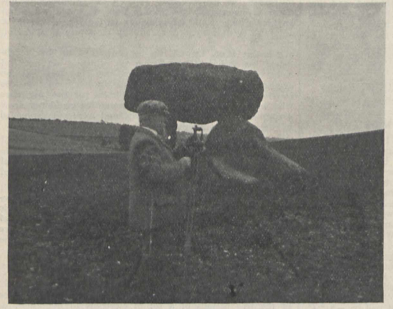
FIG. 18 .- Devil's Den, Avebury, looking towards November sunrise.

N some previous notes I have given an account of some measurements of the so-called "cromlechs" of Cornwall. In referring to this subject in a more