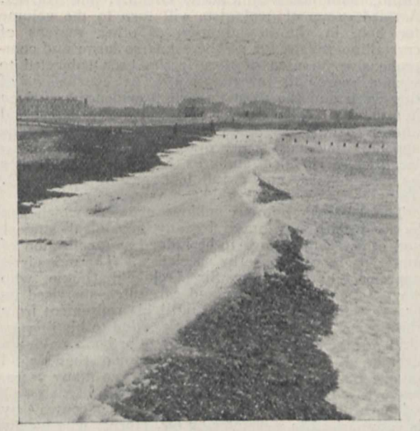
FIG. 1 - Bank of drifted Ice-crystals.

THE accompanying photographs, showing the incipient freezing of the sea during severe frost on January 4 at