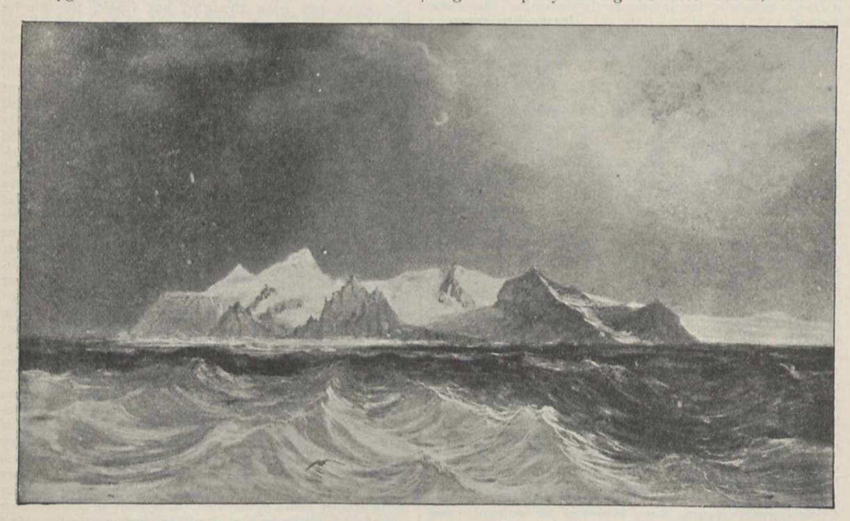
Fig. 1.-View of Elephant Island, one of the South Shetlands, in d'Urville's "Atlas." From "The Siege of the South Pole."

As soon as the Scotia could be freed from the ice it sailed for Buenos Aires for stores, &c., while Mr. Mossman, with five men, remained at the station to continue the meteorological work. The Scotia returned on February 14, bringing with it a party of observers sent by the Argentine Government, which had wisely undertaken to maintain the meteorological station; Mr. Mossman remained to help the Argentine party during its first winter, and the