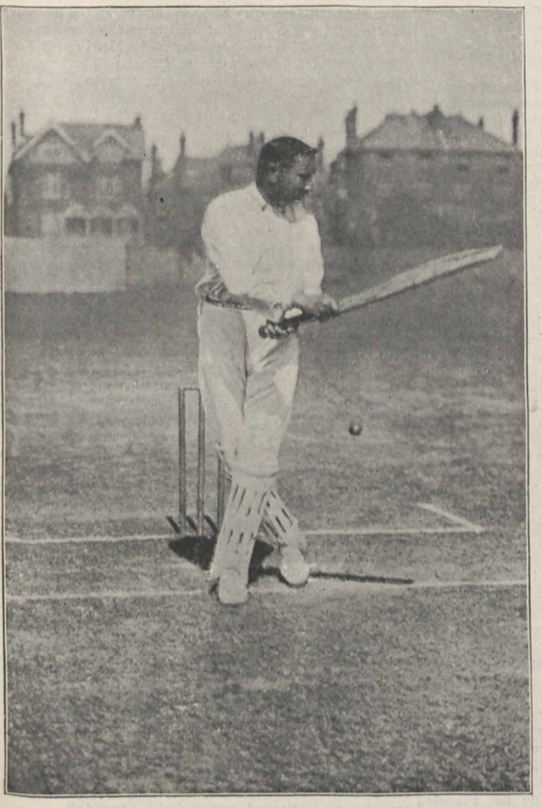
FIG. 2.-K. S Ranj tsinhji-Finish of the Leg-glance.

swing with its face always properly oriented. If he lifts both arms at the same rate by a rotation about a horizontal axis parallel to a line through the shoulders, the face of the bat will still look in the same direction; but if he moves the arms in any other way the conditions of the geometrical constraint imposed by the grip of the hands on the handle will necessitate a combined rotational and translational motion. Let anyone with bat in hand try to shape for a drive or a cut and endeavour at the same time to prevent the bat rotating round its own axis of figure, and he will find himself forced into the most awkward and constrained of attitudes. In the de-scription of plate xxii., showing Grace preparing for the on-drive the finish of which we have reproduced, the last sentence reads thus : "If you study the turn of his bat you will see that in order to bring the face of the bat against the ball he must put in a pronounced turn of the wrist." The truth is that if the right elbow is kept down the bat must take the position shown,