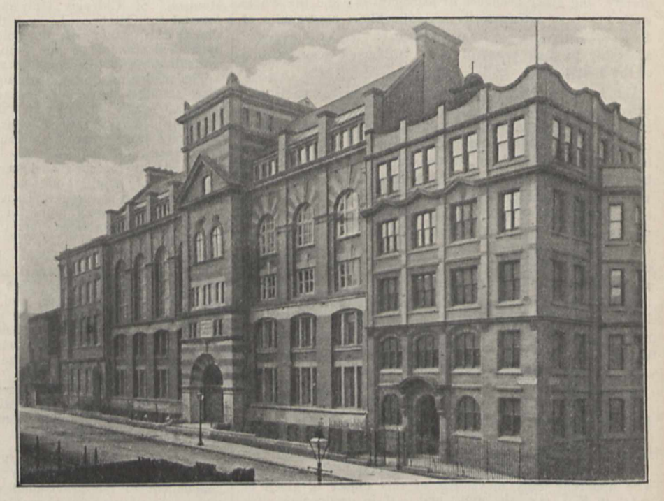
FIG. 1.- New Buildings of the Department of Zoology, University of Liverpool.

done by associating his name either with a university or with a chair in that university, or by some other great benefaction. The result was that the United States had such as that of Cornell, founded by rich universities, such as that of Cornell, founded by individuals, and he confessed that if he were a man of great wealth he would much rather posterity would remember him as having founded a university or a chair of a university than as having been a liberal subscriber to the funds of his party. Though a good understanding existed between this country and other Great Powers, pro-vision should be made for the war in commercial supremacy. What were the armaments with which we were to provide ourselves for the purposes of defence in the war of commercial supremacy? They were those provided by science and by scientific research. Fortunately for us, the inventions of science could not be patented in the interests of any one particular country, but the slightest improvement upon them could, and it was those improvements, arrived at by scientific research, which would make or mar the supremacy of any country in commerce. The power of adding to a train-load that could be carried by a locomotive in the other hemisphere might make a differ-