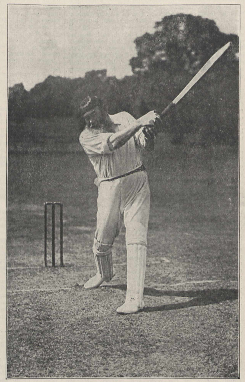
FIG. 1.-W. G. Grace-Finish of an On-drive.

trates some essential part of a particular stroke, it is not possible to choose for reproduction any that might be regarded as representative. W. G. Grace, for example, is shown in twenty-six different attitudes, and all have some lesson to tell. In the photograph reproduced we have the finish of an ondrive, in which the turn of the body has aided powerfully in giving full effect to the stroke. The eyes are