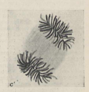
Fig. 1.—Diagrams of nuclear divisions. a b c in prothallus. a'b' c' in embryo.

cristata apospora show no nuclear migration, whereas about 73 per cent. of those of Nephrodium pseudo-mas, Rich., var. polydactyla, Wills, exhibit this phenomenon. This is easily explained. Whereas in the former the nuclei of the aposporously developed prothalli have already the full complement of somatic chromosomes, in the latter