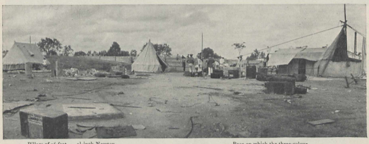
Pillars of 16-feet coronagraph.