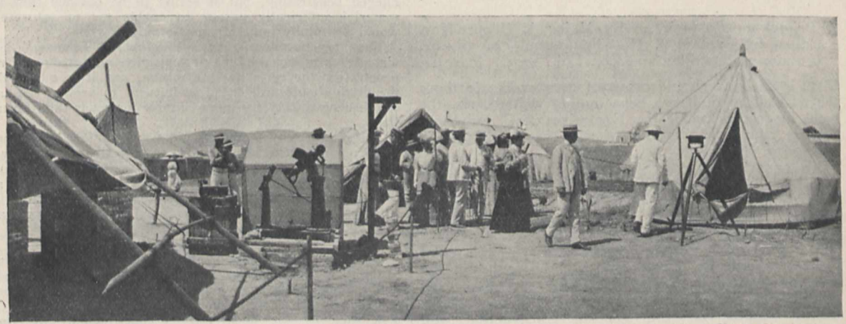
6-inch prismatic camera.

cent became smaller and smaller at about the same rate as the clouds over the sun became thicker and thicker. The clouds won! The moment of second contact could not be observed! We went, however, through our programmes, knowing that we were photographing nothing. Venus became a brilliant object in the west seen through a break.