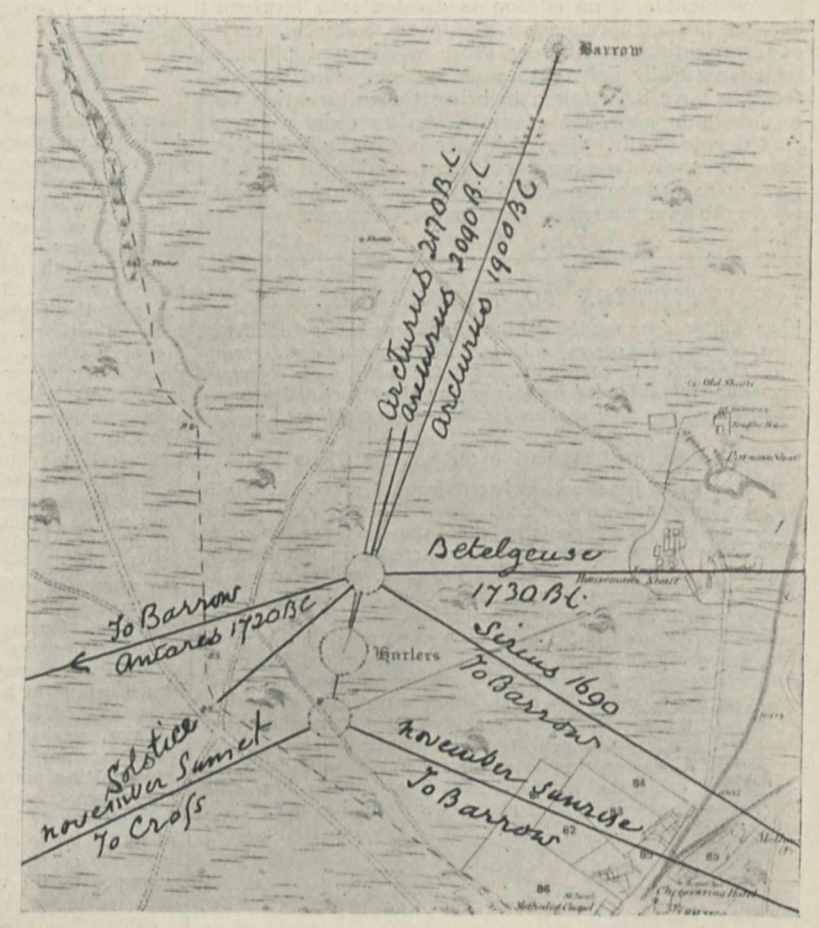
Fig. 20.—The sight-lines at the Hurlers, showing high northern azimuths among others. From the

To this result some importance must be attached, first, because it brings us into presence of the cult of the solstitial year, secondly, because it shows us that the system most in vogue in Brittany was introduced in relation to that year. In Brittany, as I have before shown, the complicated alignments, there are 11 parallel rows at Le Ménac (p. 99) (there were 8