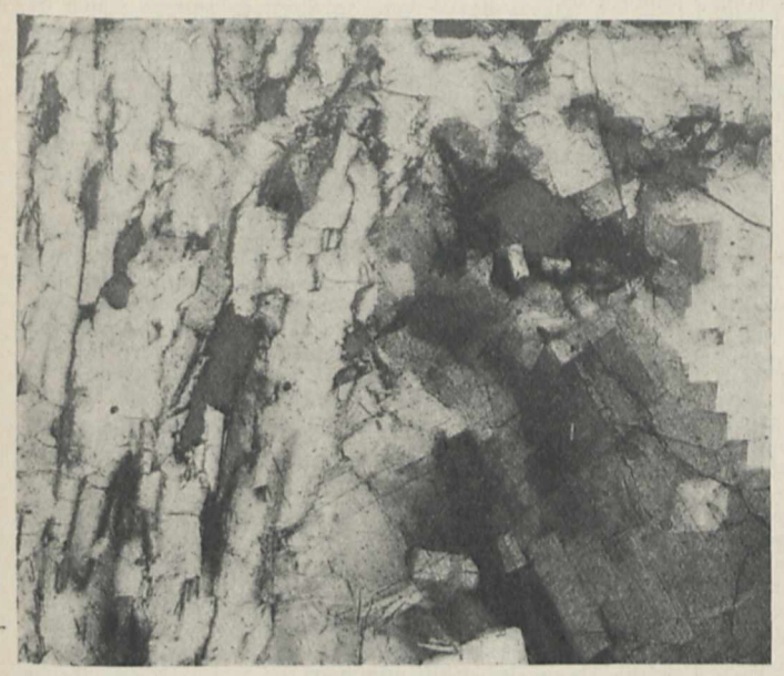
Fig. 1.—Tabular Crystals of Bytownite from Middle or Crucible. Isomorphism and Thermal Properties of the Felspars."

temperature is to be regarded as a superheated solid or as a liquid crystal, in which deorientation is prevented by extreme viscosity.