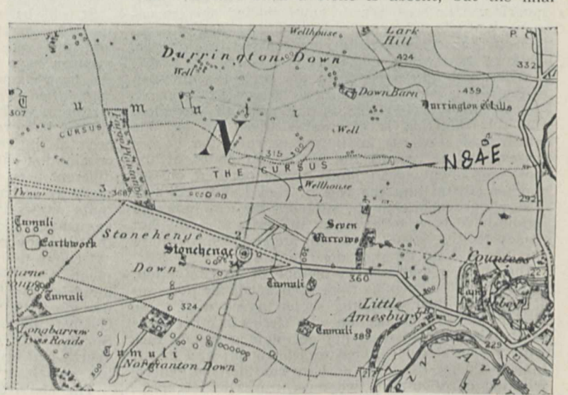
Fig. 19.—Reprint of Ordnance Map showing that the Cursus at Stonehenge is nearly parallel to the Merrivale Avenue. The azimuth is 82° and not 84° as shown in the figure.

It is worth while to say a word as to the different treatment of the ends of the south avenue now that it seems probable that it was used to watch the rising of the Pleiades. At the east end there is what archæologists term a "blocking stone"; these observations suggest that it was really a sighting stone. At the west end such a stone is absent, but the final