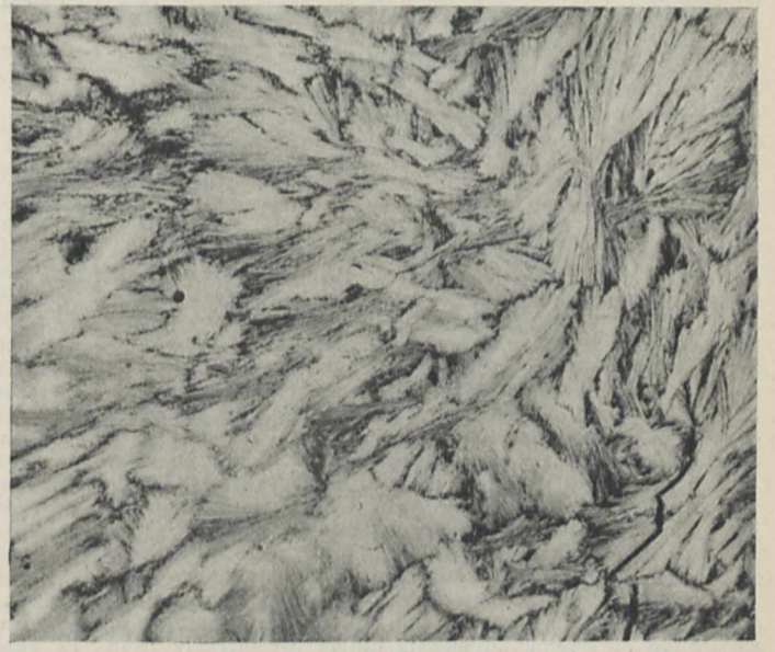
Fig. 2.—Spherulite of Plumose Bundles of Prismatic Crystals of Labradorite. From "The Isomorphism and Thermal Properties of the Felspars."

fallen below the range proper to normal crystallisation. Those natural rocks in which the felspar crystals show a zoned structure (the outer zones richer in albite) must have crystallised without undercooling, and, indeed, their felspars