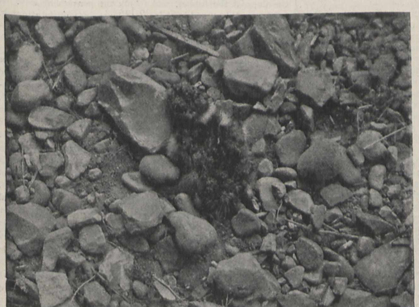
Fig. 1 .- Young Peewit hiding. From "The Country Day by Day."