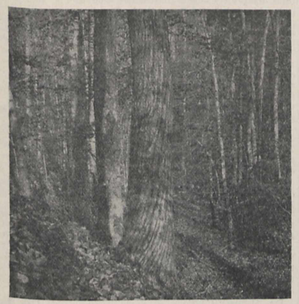
Fig. 1.-Twisted Furrows in Bark of Chestnut from Seed.