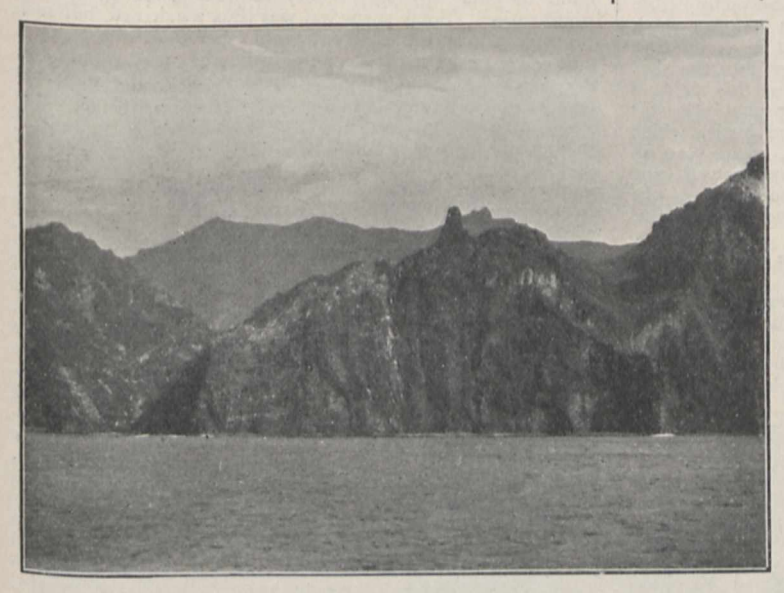
Fig. 1.—Gough Island, showing hanging valley truncated by shore cliff.

A FTER getting free from the winter quarters in the South Orkneys on November 23, 1903, the Scotia left for the Falkland Islands and Buenos Aires to get into communication with home and obtain a fresh stock of coals and