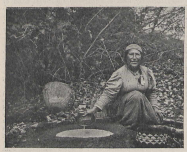
Fig. 1.—Hupa woman soaking acorn meal on the river shore. The meal is placed in a crater of sand, water is heated in the basket to the right by dropping hot stones into it, and the hot water is ladled out by means of a basket-cup and poured over the meal until it loses its bitter taste.

were concerned with the cultivation of their fields. All the details of the grass-lodges were symbolic. The social organisation was by villages, at the head of each of which was a chief and a subchief. Election to the chieftainship was never through heredity alone; it was possible for the youngest and meanest-born boy of the village to rise to this position through bravery, generosity, and kindness. In general, the gods of the Wichita are spoken of as "dreams." The sixty tales refer to the first period or Creation, the second period or transformation, and the third period or the present. A few tunes are given by F. R. Burton. Three long Wichita tales by the same indefatigable observer will be found in the Journal of American Folk-lore (vol. xv. p. 215, xvi. p. 160, xvii. p. 153). Legends of ancient time were related that the listeners might realise that evil creatures and monsters and evil spirits no longer exist; they were removed from the earth and their destructive powers taken from them by Wonderful Man, who knew that the world was changing, so that human beings might be human beings, and animals exist as animals to serve as food for man. But, above all, the value of many stories for the young lay in the lesson taught by example