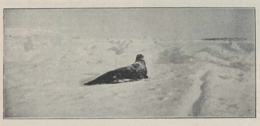
Fig. 3.-Weddell Seal-off Coats Land.

After the escape from the ice the Scotia turned northeastwards to continue the oceanographical survey of the Weddell Sea, and had some very successful deep-sea trawling in high southern latitudes—one haul in 71° 22′ S. 16° 34′ W. (1410 fathoms) yielding more than sixty species of animals. Ross's reported deep of 4000 fathoms no bottom was shown conclusively not to exist, the whole Weddell Sea