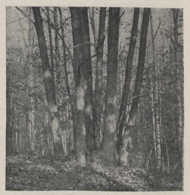
Fig. 2.—Straight Furrows in Bark of Coppice Chestaut.

Circular No. 30, by Mr. Gifford Pinchot, is a description of an exhibit of forest planting in woodlots at the Louisiana Purchase Exposition. The exhibit is intended to illustrate the different methods of planting with different species and mixtures suitable for the different parts of the United