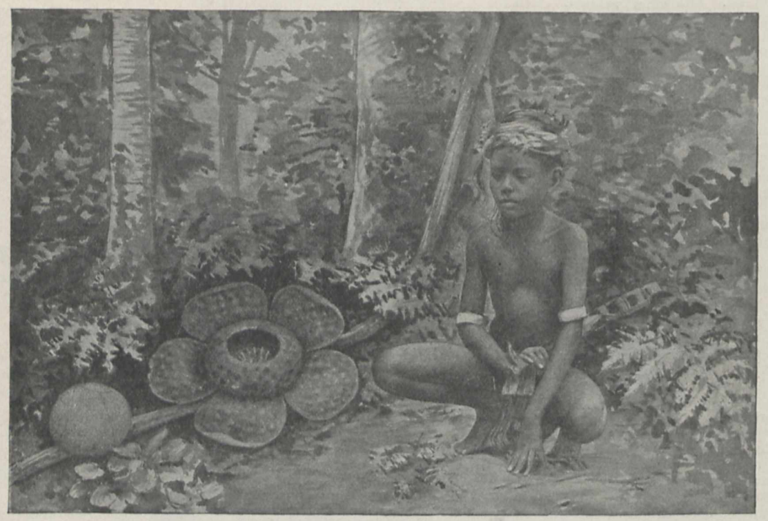
Fig. 2.--Rafflesia Tuan-Mudæ, Becc. (flower 22 inches in diameter). From "Wanderings in the Great Forests of Borneo."

opinion that at least two species of orang-utan exist in Borneo. Dr. Beccari has come to the following conclusions:—There is no well authenticated case of a female with lateral face-expansions, though there is some evidence that such do occur; but there are young orangs with milk dentition which have them well developed, and adult male individuals are found with the expansions rudimentary. Not associated with the above character is the frequent absence of the terminal phalange of the hallux with the total or partial suppression of the nail. Evidently there is great variability in the orang, but Dr. Beccari holds that there is only one species of Simia satyrus with two main varieties, "tjaping" with lateral adipose cheek-expansions and highly developed cranial crests, and "kassa" with no lateral cheek-expansions and its skull devoid of strongly pronounced crests. Nevertheless, he suggests "that in a remote past the Mayas tjaping