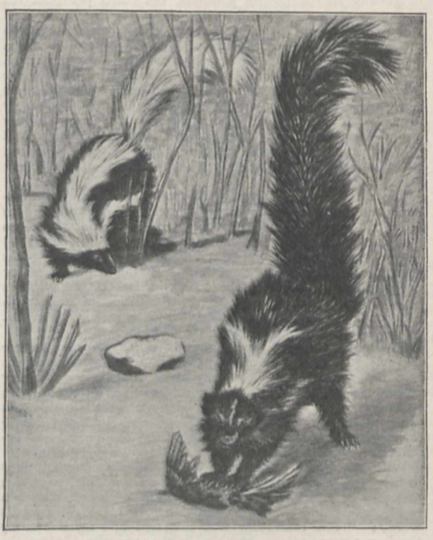
Fig. 2.-Long-tailed Skunk. From Elliot's "Mammais of Middle America."

classic Rome. One point in regard to the plan of the work—whether intentional or accidental it is not easy to say—strikes us as unsatisfactory. In the case of certain species, such as Odontocoelus americanus and Ovis cervina (pp. 69 and 84), for example, of which the typical form does not occur within the limits of the area under consideration,