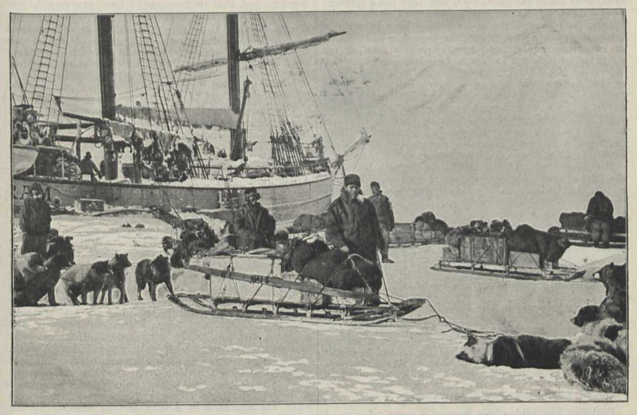
FIG. 2.-Sledging expedition ready to start. Spring, 1901. From "New Land," by Otto Sverdrup.

"The members of the expedition, who were not much used to the sea, turned very white, and looked extremely serious. They trooped to the doctor and complained of various symptoms; some had headache, some shivering fits, and some pains in the stomach, which they had contracted, they knew not how; but none of them mentioned the malady by its right name. The doctor, however, came to the conclusion that the complaint with the many different aspects, had a single and fairly simple name, to wit, sea sickness; and for it there was but one and an equally simple remedy, dry land. Unhappily we had forgotten to bring any with us in our otherwise so well equipped Expedition, but it was hoped it might be found somewhere north in the Arctic Ocean, and this appeared to console the sufferers."