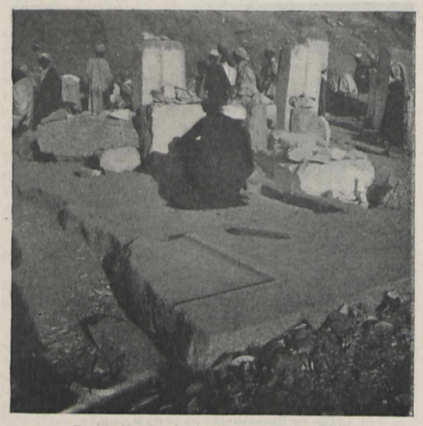
FIG. 2.- The Granite Threshold and Pillared Hall.

These reliefs originally formed part of the decoration of the walls of the main pillared hall of Nebkherurā's temple. This hall, only a part of which has as yet been uncovered, stands upon an artificially squared platform of rock, immediately to the south of the Hathor shrine of the great temple of Deir el-Bahari, and separated from it by a small open court about sixty feet across. The platform is about fifteen feet high. Its sides were masked by a magnificent wall of finely-squared and fitted limestone blocks, built in bonded courses of