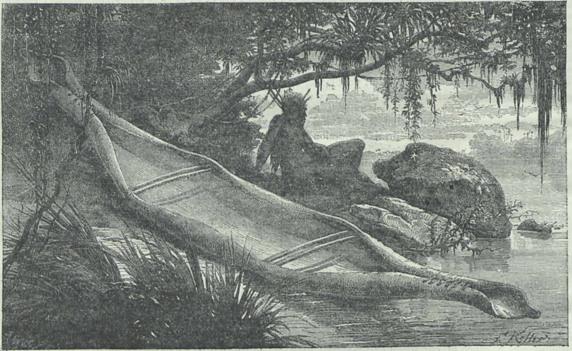
FIG. 1.—Bark Canoe of Wild Indians (Aráras and Caripunás).