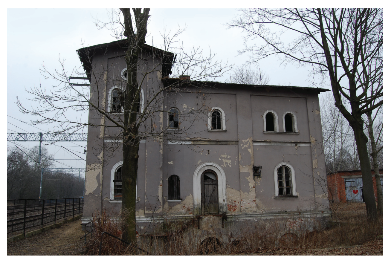
Fig. 3. Former water tower

Il. 3. Dawna wieża wodna