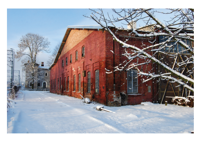
Fig. 9. The oldest part of the roundhouse (photo by P. Mierosławski)

Il. 9. Najstarsza część hali wachlarzowej (fot. P. Mierosławski)