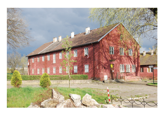
Fig. 4. Office and accommodation building II. 4. Budynek biurowo-noclegowy