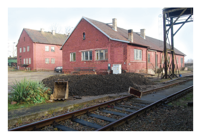
Fig. 5. Office and warehouse buildingII. 5. Budynek biurowo-magazynowy