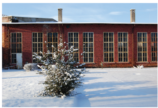
Fig. 7. View of the machine hallIl. 7. Widok hali maszyn

König. Both of these companies operated in Warsaw in the pre- [27] and post-war [28] periods, which may suggest that the Germans entrusted the adaptation of designs or the execution to Polish private companies.