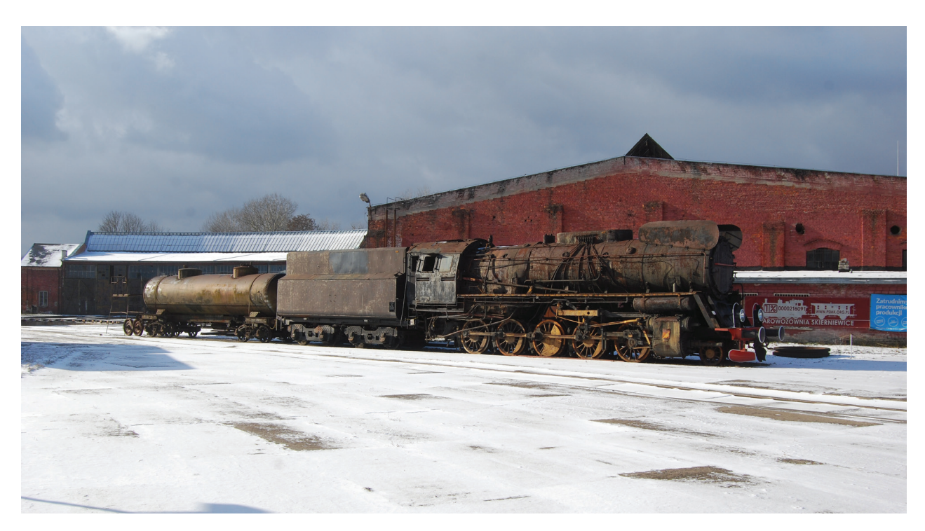
Fig. 2. View of the roundhouse

Il. 2. Widok hali wachlarzowej