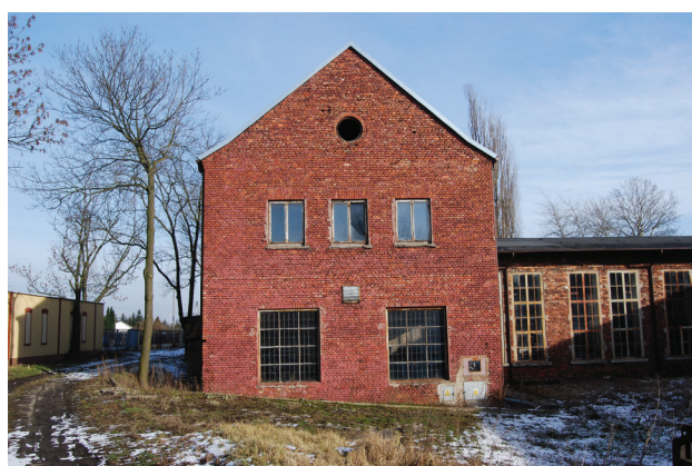
Fig. 6. Workshop and social buildingII. 6. Budynek warsztatowo-socjalny