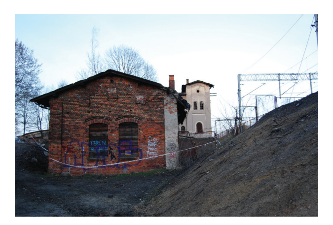
Fig. 8. Pumping station Il. 8. Pompownia

Upper Silesian, Żnin, Rogowska and Raciborski Ore railroads. Narrow-gauge railroads, however, generally (though not always) play a significantly smaller role of buildings and a larger role of linear infrastructure facilities than museums on normal track.