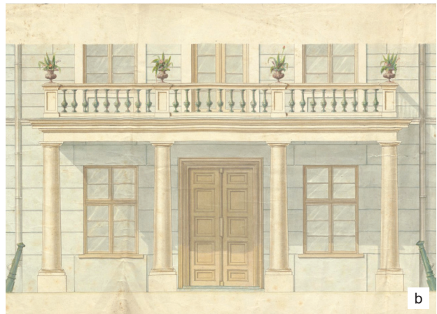
Fig. 6. Front avant-corps with the main entrance and balcony: a) current state with the remains of the three-centered arch, the level of the Baroque superstructure and point rebuilding in the zone of the balcony slab, b) design of the façade with a classicist balcony supported by Tuscan columns

Il. 6. Ryzalit środkowy z głównym wejściem i balkonem: a) stan obecny z pozostałościami łuku koszowego i punktowymi przemurowaniami w strefie płyty balkonowej, b) projekt fasady z klasycystycznym balkonem wspartym na kolumnach toskańskich