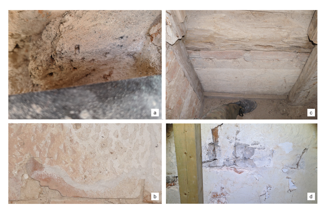
Fig. 3. Relics of the façade finish and roof covering, associated with the second chronological phase: a) a fragment of the corner rustication of the nave made of grey plaster coloured in the mass with a needle-punched face, b) Baroque beaver tail tile reused as a levelling layer in the eastern room of the front tract, c) a well-preserved white background of the western façade in the under-eaves zone, with clear remains of the removed cornice, d) the lintel arch of the window on the ground floor of the western façade, lowered and converted into a door to the side wing. The visible horizontal border of the grey window trim and the white background above indicates that the surrounds did not repeat the shape of the lintel

II. 3. Relikty wykończenia elewacji oraz pokrycia dachu, wiązane z drugą fazą chronologiczną: a) fragment narożnego boniowania korpusu z szarego tynku barwionego w masie o igłowanym licu, b) barokowa dachówka karpiówka wykorzystana wtórnie jako warstwa wyrównawcza we wschodnim pomieszczeniu traktu frontowego, c) dobrze zachowane białe tło elewacji zachodniej w strefie podokapowej, z wyraźnymi pozostałościami usuniętego gzymsu, d) łuk nadprożowy okna parteru elewacji zachodniej, obniżonego i przekształconego na drzwi do pomieszczeń skrzydła bocznego. Widoczna pozioma granica szarej opaski okiennej i białego tła powyżej wskazuje, że opaski nie powtarzały kształtu nadproża