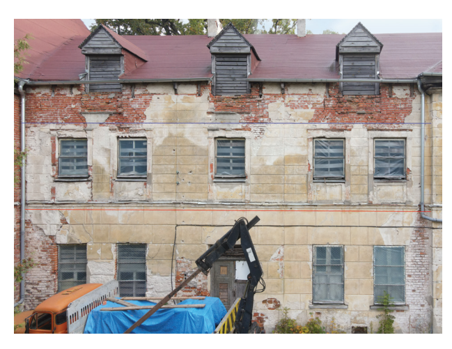
Fig. 7. The western wing has two levels of the superstructure that are clearly visible. Phases three through five. There is no fourth phase in the eastern wing, the 1<sup>st</sup> floor was erected together with the ground floor in the third phase

The works carried out as part of the first stage, begun in 1858 [26], included raising the wings by constructing a new, higher truss at the attic level with a knee wall housing living quarters with "English-style" windows<sup>37</sup>.