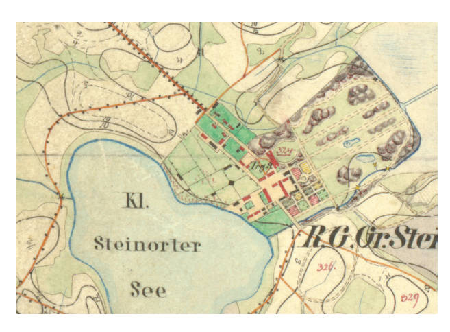
Fig. 10. Plan of the village from 1862. The palace was depicted with four annexes, which correspond to the side wings and rear alcoves. The scale of the study did not allow for a correct representation of the kitchen tower (source: [30])

It was established that the body and façades had not undergone any significant changes since the 1860s and the