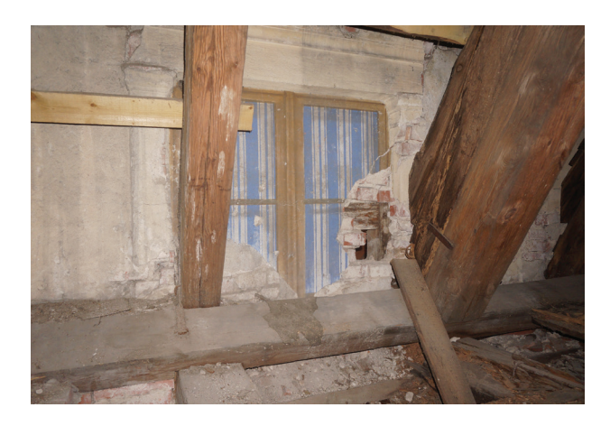
Fig. 8. The gable wall of the western wing, built as part of the first stage of the fifth phase. The brick and skeleton structure of the gable is visible, also repeated in the knee walls

II. 8. Ściana szczytowa skrzydła zachodniego, nadbudowana w ramach pierwszego etapu fazy piątej. Widoczna murowano-szkieletowa konstrukcja szczytu, powtórzona również w ścianach kolankowych