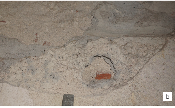
Fig. 9. Solutions characteristic of the fifth phase: a) the façade of the kitchen tower from the second stage of the fifth phase, referring in detail to the façade from the fourth phase (there are no traces in the homogeneous wall suggesting the later addition of neo-Gothic dormers), b) a well-preserved fragment of unpainted plaster with a rustication profile, used on the tower and the side and rear façades of the nave (the alcoves were prepared in the same way using lighter plaster)

II. 9. Rozwiązania charakterystyczne dla piątej fazy: a) elewacja wieży kuchennej z etapu drugiego fazy piątej, nawiązująca detalem do elewacji z fazy czwartej (w jednorodnym murze brak jest śladów sugerujących na późniejsze dodanie neogotyckich facjatek), b) dobrze zachowany fragment niemalowanego tynku z profilem boniowania, zastosowanego na wieży oraz elewacjach bocznych i tylnej korpusu (w ten sam sposób opracowano alkierze przy użyciu jaśniejszego tynku)