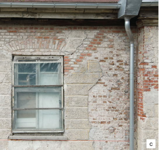
Fig. 2. The rear façade of the nave with the alcoves, which were added in the third stage of the fifth phase: a) the average border of the walls from the first and second phases and the location of the arcaded niches are marked on the view, b) a close-up of the most visible niche by the door to the garden living room (it has chiseled edges below the arch; both the window and the door have rebuilt lintels and glyphs), c) the 1<sup>st</sup> floor window with a clearly legible three-centered arch of the lintel. Below the window sill, the border of the walls of the first and second phase is visible

II. 2. Elewacja tylna korpusu wraz z alkierzami, które dodano w trzecim etapie fazy piątej: a) na widoku zaznaczono uśrednioną granicę murów z pierwszej i drugiej fazy oraz lokalizację arkadowych nisz, b) zbliżenie na najlepiej widoczną niszę przy drzwiach do salonu ogrodowego (ma rozkute krawędzie poniżej łuku; zarówno okno, jak i drzwi mają przemurowane nadproża i glify), c) okno piętra z dobrze czytelnym łukiem koszowym nadproża. Poniżej parapetu widoczna granica murów pierwszej i drugiej fazy