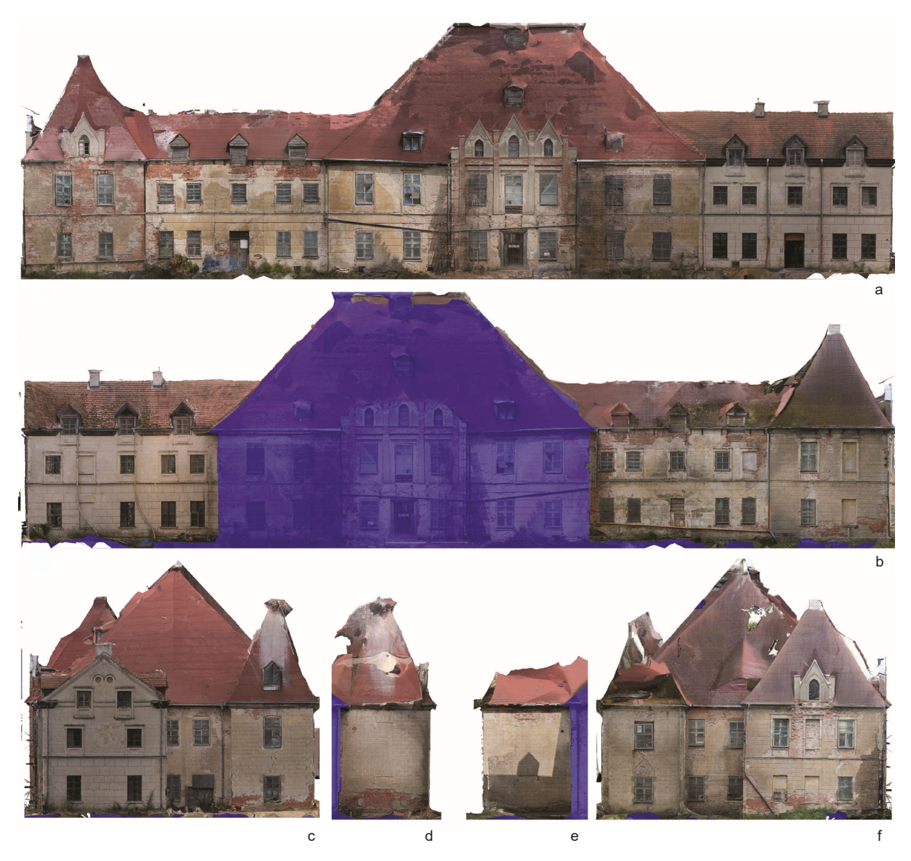
Fig. 1. View of the main façades of the building: