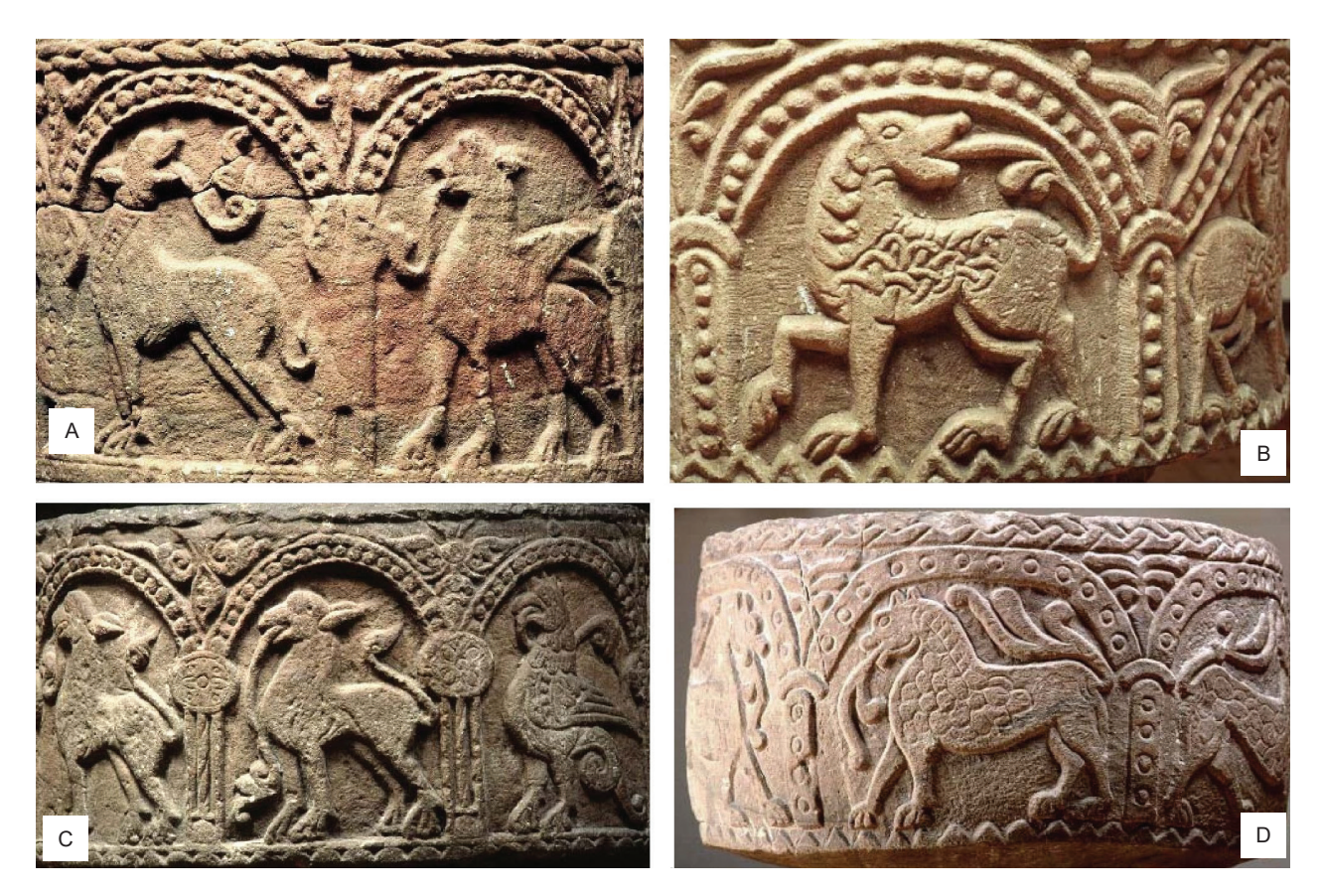
Fig. 10. Details of baptismal fonts decorated with motifs of fantastic animals framed by arcades from the Bestiarius Group, 3^{rd} — 4^{th} quarter of the 12^{th} century: A. Filsby (Småland),