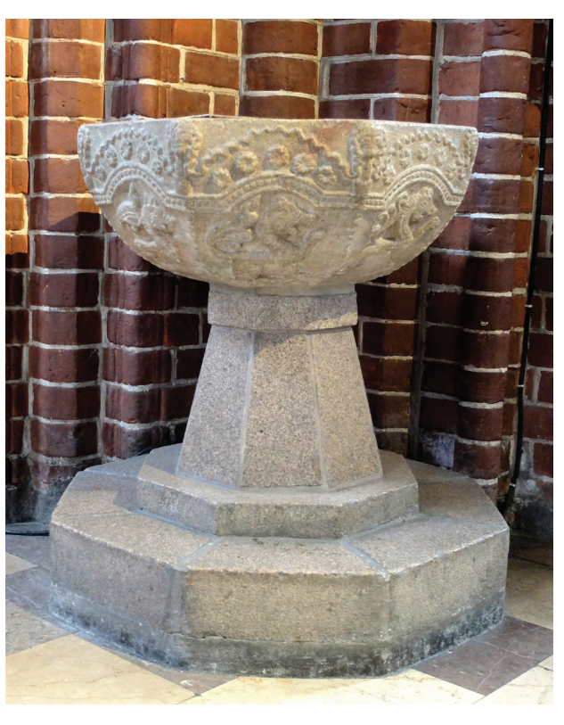
Fig. 4. The baptismal font from the parish church in Grudziądz mounted on a modern granite base

The octagonal bowl with a diameter of 87 cm and a height of 35 cm has a flattened form. Each of the eight fields, similar to the spherical triangle, is filled with analogously composed decoration realized in a shallow relief. In spite of difficulties resulting from the processing of hard material, the sculptor tried to carefully develop the shapes of each of the figural and ornamental elements, additionally enriching the bodies of animal beasts with a rich