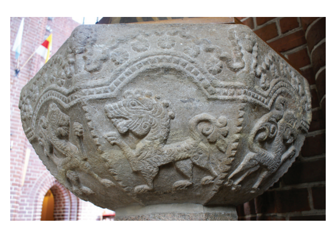
Fig. 7. The first and central field of the bowl composition, from which the procession of walking beasts begins and towards which it heads

(Fig. 6). Clear ornamentation styling of the beast figures makes it difficult to determine their biological species. Linear grooves on their bodies and necks suggest shortness of the coat, which along with the predatory character of paws and mouths allows us to suppose that the beasts on the bowl can be images of a leopard, tiger, or puma, or – which seems to be the most convincing – they are only a presentation of predatory animals. The beasts in seven fields are shown by the right profile. A highly raised front paw and the arrange-