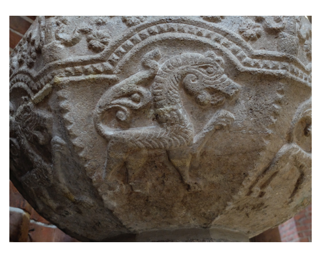
Fig. 5. One of the beasts decorating the baptismal bowl

II. 4. Czasza chrzcielnicy z kościoła farnego w Grudziądzu osadzona na współczesnej granitowej podstawie