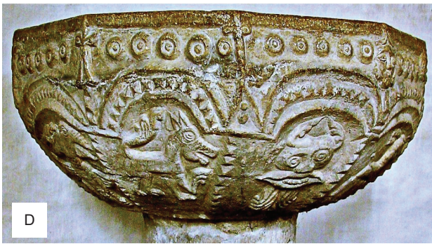
Fig. 9. Bowls of Scandinavian baptismal fonts from Fröjel Group: A. Fröjel, parish church, B. Statens Historiska Museum Stockholm, C. Västra Karaby (currently Statens Historiska Museum Stockholm)

D. Magleby, parish church