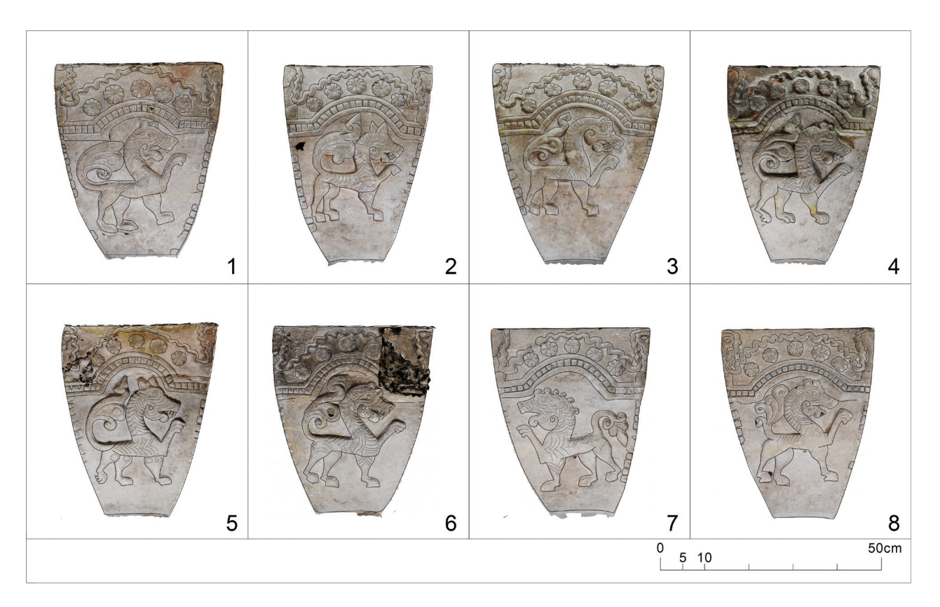
Fig. 6. Combination of representations of the beast on the baptismal bowl (photo and elaborated by F. Hackemer) II. 6. Zestawienie przedstawień bestii na czaszy chrzcielnicy (fot. i oprac. F. Hackemer)

(Fig. 6). Clear ornamentation styling of the beast figures makes it difficult to determine their biological species. Linear grooves on their bodies and necks suggest shortness of the coat, which along with the predatory character of paws and mouths allows us to suppose that the beasts on the bowl can be images of a leopard, tiger, or puma, or – which seems to be the most convincing – they are only a presentation of predatory animals. The beasts in seven fields are shown by the right profile. A highly raised front paw and the arrange-