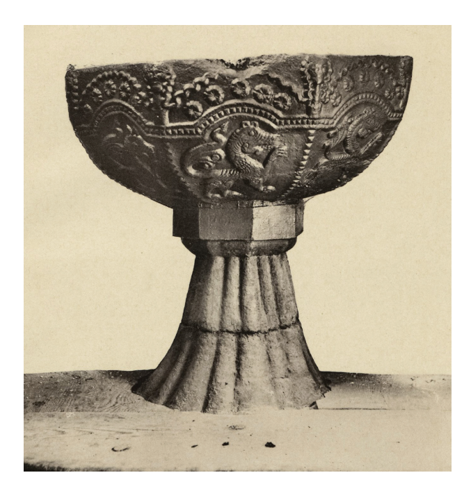
Fig. 3. Baptismal font from the parish church in Grudziądz, photograph reproduced in 1894 (source: [4, Table 3])

II. 3. Chrzcielnica z kościoła farnego w Grudziądzu, fotografia reprodukowana w 1894 r. (źródło: [4, tab. 3])