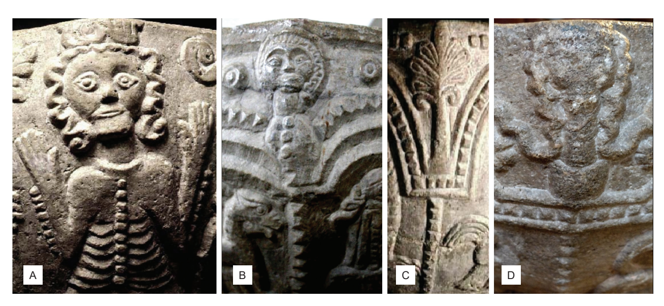
Fig. 11. A characteristic motif of heads/human figures/Tree of Life on the edges of the baptismal font fields in the space between the arcades: A. Falsterbo (photo by L. Karlsson, Statens Historiska Museum Stockholm), B. Magleby (photo by E.G. Antoñana), C. excerpt from baptismal font (photo by L. Karlsson, Statens Historiska Museum Stockholm), D. Grudziądz (photo by J. Nowiński)

II. 11. Charakterystyczny motyw głów/ postaci ludzkich/ Drzewa Życia na krawędziach pól chrzcielnicy w przestrzeni między arkadami: A. Falsterbo (fot. L. Karlsson, Statens Historiska Museum Stockholm), B. Magleby (fot. E.G. Antoñana),