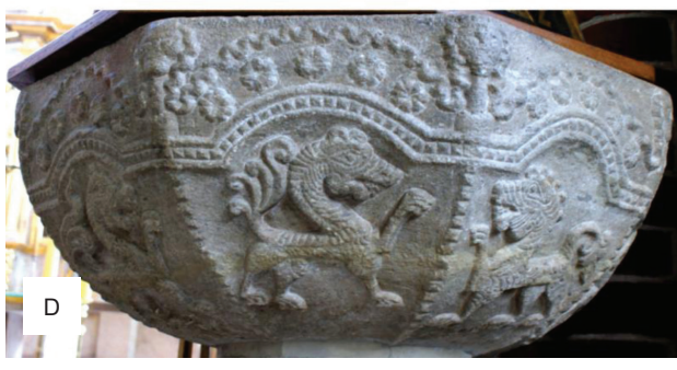
Fig. 8. Baptismal fonts associated with Fröjel Group with a bowl decorated with fantastic animals/beasts. A. Parish church in Chehmno, B. Church in Lubiana, currently in the National Museum in Szczecin, C. Parish church in Wilamów, D. Parish church in Grudziądz