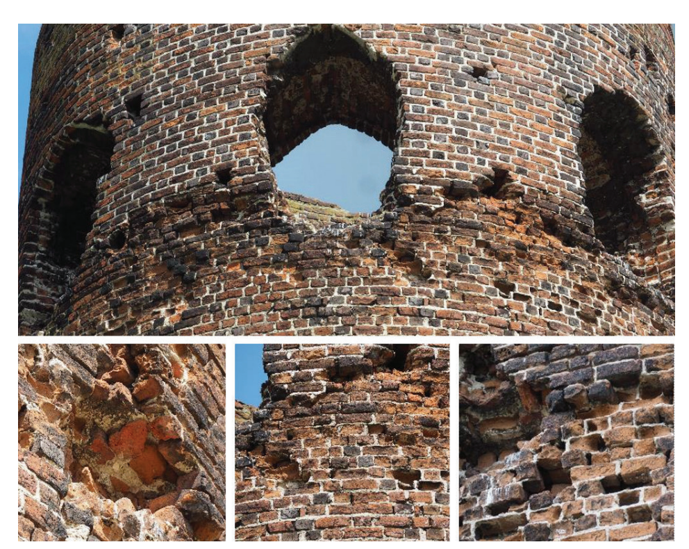
Fig. 8. Castle in Koło. Examples of the state of preservation of the tower walls

II. 8. Zamek w Kole.Przykłady stanu zachowania murów wieży