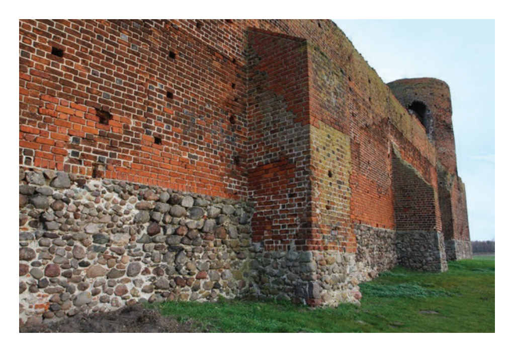
Fig. 10. Castle in Koło. A fragment of the outer façade of the west wall – visible extensive restorations of brick and stone faces as well as microbiological layers

Il. 10. Zamek w Kole. Fragment elewacji zewnętrznej muru zachodniego – widoczne rozległe uzupełnienia lica ceglanego i kamiennego oraz nawarstwienia mikrobiologiczne