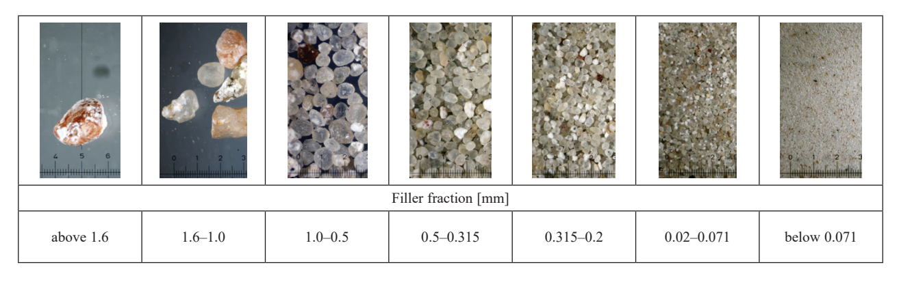
Table 2. Exemplary distribution of the aggregate fraction of the mortar from phase II (elaborated by A. Gralińska-Grubecka) Tabela 2. Przykładowy rozkład frakcji kruszywa zaprawy z II fazy (oprac. A. Gralińska-Grubecka)