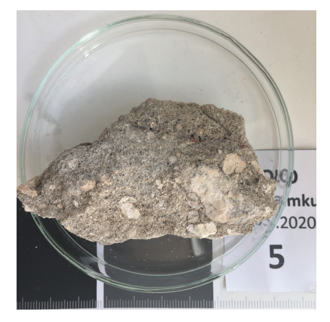
Fig. 3. Castle in Koło. An exemplary sample of medieval mortar (elaborated by K. Witkowska, 2020)

Interesting in the aspect of historical construction techniques are the results of analyses on the mortar binder. On the basis of the petrographic analysis, it was found that carbonate binder (micrite) was present in all examined samples, but it shows some differentiation. Lime lumps (micrite aggregates) isolated from the binder mass