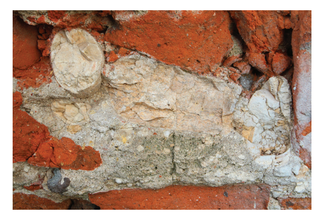
Fig. 4. Castle in Koło. Close-up of the mortar in the joint with visible fragments of calcined limestone

Il. 4. Zamek w Kole. Zbliżenie zaprawy w spoinie z widocznymi okruchami kalcynowanego kamienia wapiennego