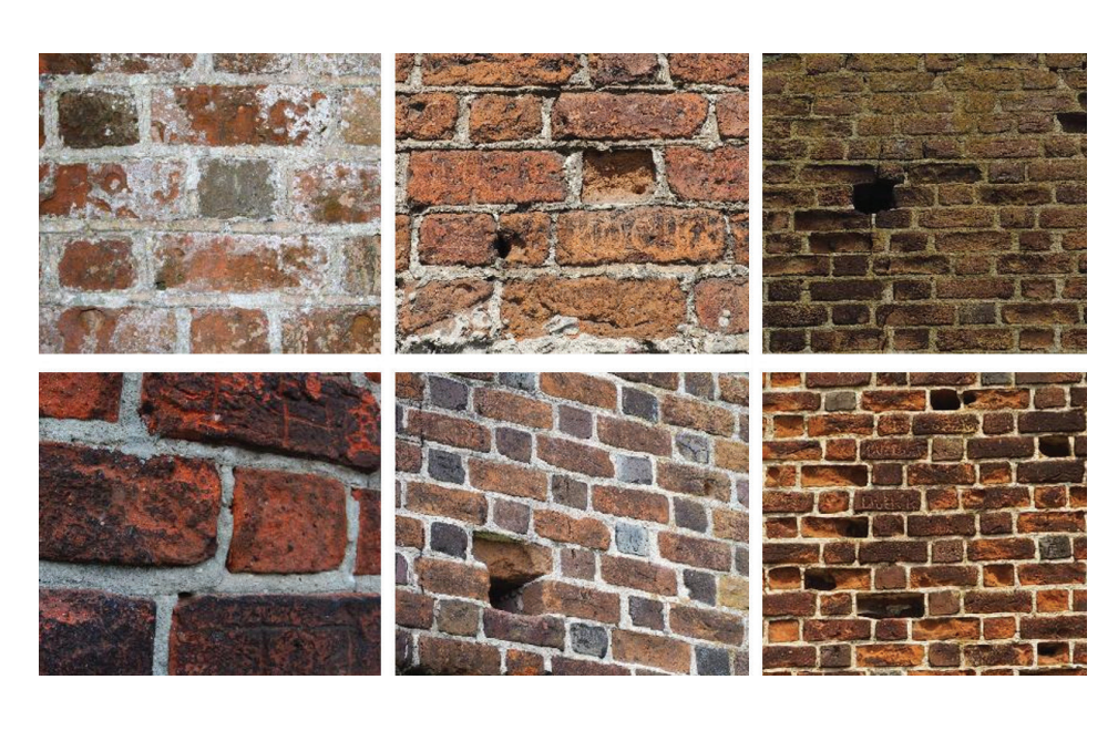
Fig. 7. Castle in Koło. Examples of the state of preservation of the medieval face of the wall