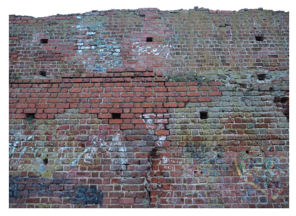
Fig. 6. Castle in Koło. The inner side of the western wall with numerous graffiti and complemented bricks on the wall face. The softly ending crown of the breast wall is noteworthy

Il. 6. Zamek w Kole. Wewnętrzna strona muru zachodniego z licznymi graffiti, uzupełnieniami lica. Uwagę zwraca miękko zakończona korona przedpiersia