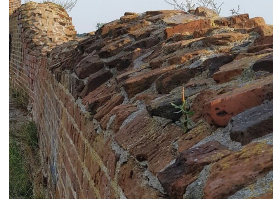
Fig. 9. Castle in Koło. The crown of the breastwork softly prepared during renovation works in the 20<sup>th</sup> century

9. Zamek w Kole. Korona przedpiersia miękko opracowana podczas prac remontowych w XX w.