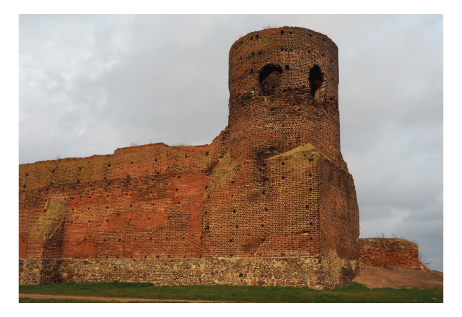
Fig. 1. Castle in Koło. A tower and a fragment of the western wall

II. 1. Zamek w Kole. Wieża i fragment muru zachodniego