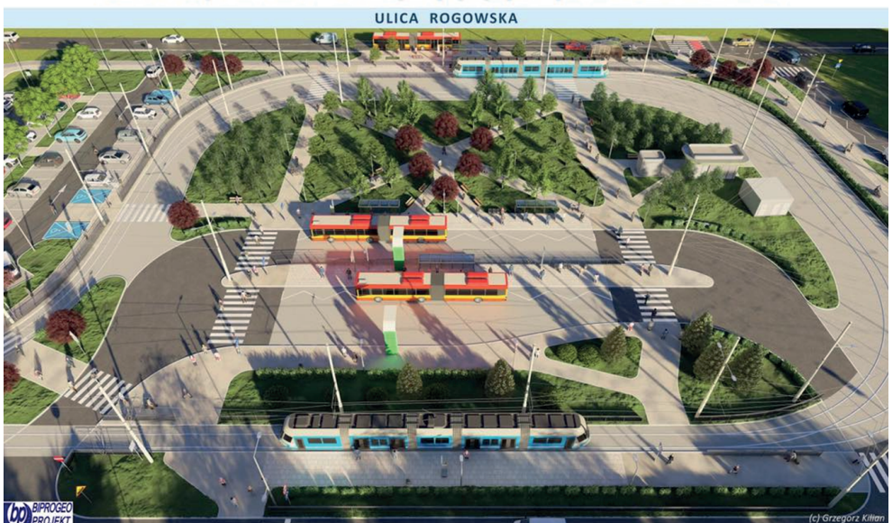
Budowa trasy autobusowo – tramwajowej łączącej Nowy Dwór z Centrum Wrocławia