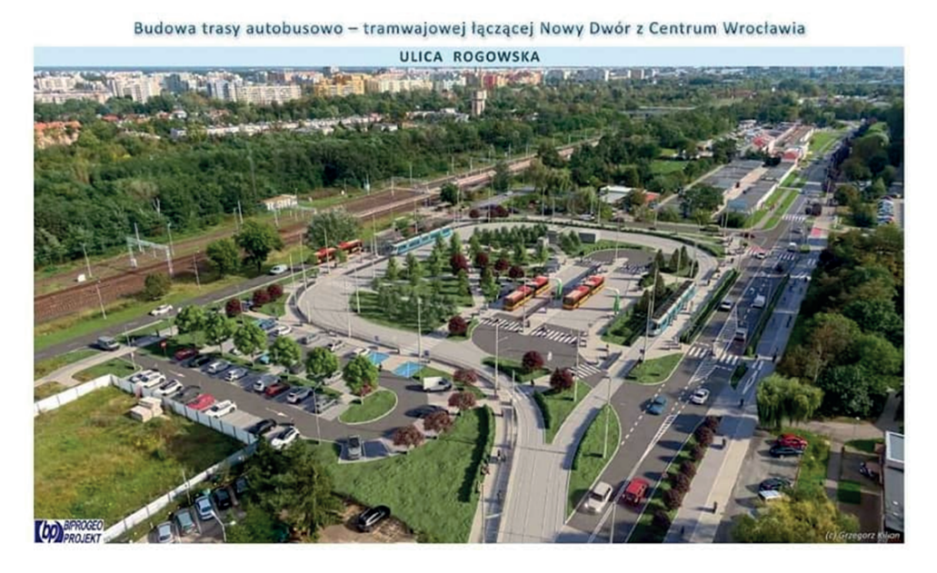
Fig. 2. Layout of the Nowy Dwór loop in Rogowska Street

The appropriate use of P+R car parks makes it possible to create synergies between the various modes of transport offering their services within Wroclaw. An example of this is the bus and tram terminal on Rogowska Street, situated at the end points of the Bus and Tram Route (Trasa Autobusowo-Tramwajowa, TAT). It represents a modern approach to the cooperation of various elements of the transport system – in addition to the above-mentioned components (car park, bus and tram stops), it also offers the possibility of changing trains (Wrocław Nowy Dwór station) or bicycles (cycle paths); in addition, a green area (small park) has been created locally.