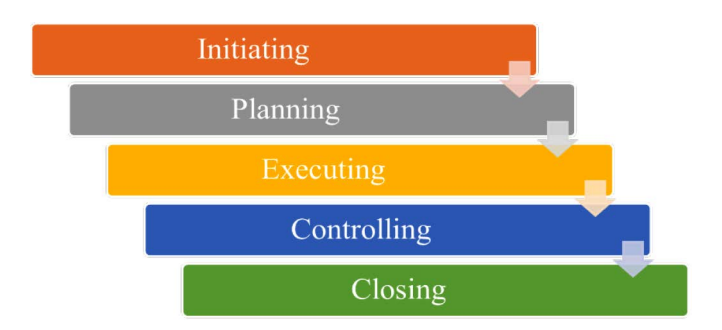
Fig. 2. Groups of processes in IT project management

The goal of project management is to complete the project successfully thanks to the effective conduct of project activities, including choosing the right methodology, meeting the requirements of stakeholders, as well as not exceeding the budget and deadline for project implementation (Wyrozębski, 2011). In project management there are five groups of processes as shown in Figure 2.