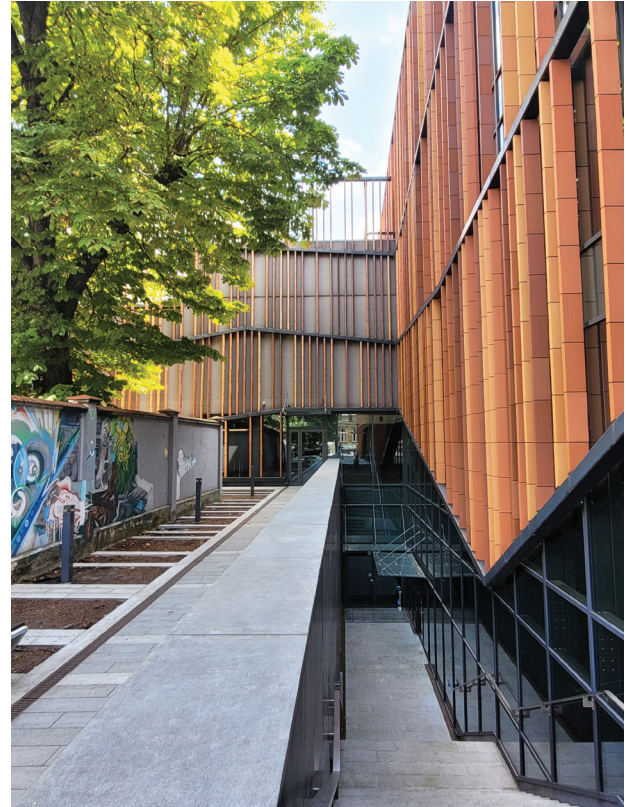
Fig. 2. Małopolska Garden of Art, view from J. Szujkiego Street