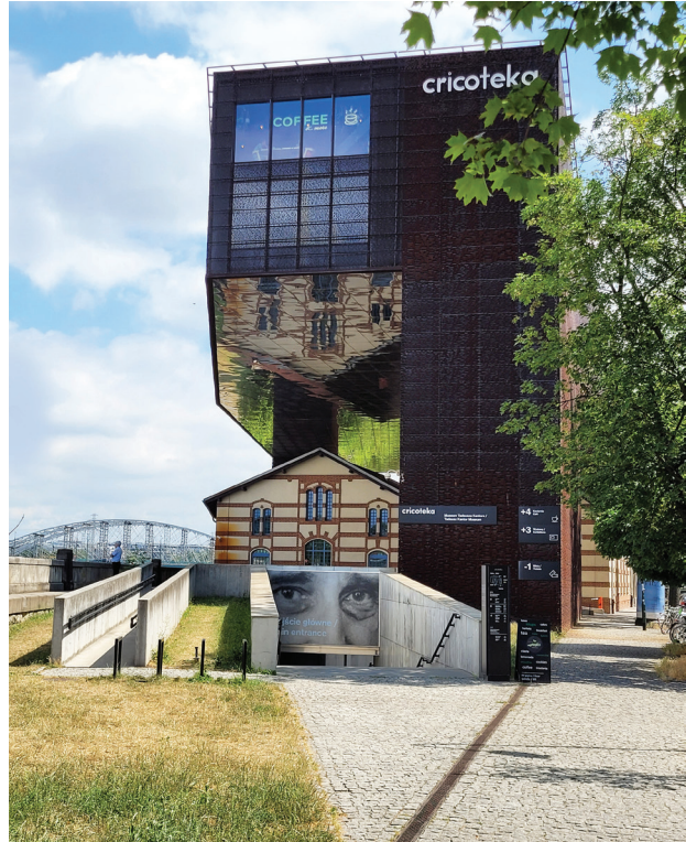
Fig. 4. Centre for the Documentation of the Art of Tadeusz Kantor Cricoteka on Nadwiślańska Street

Il. 3. Ośrodek Dokumentacji Sztuki Tadeusza Kantora Cricoteka przy ul. Nadwiślańskiej. Widok na odrestaurowane budynki dawnej Elektrowni Podgórskiej mieszczące m.in. salę wielofunkcyjną