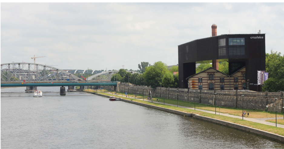
Fig. 5. Centre for the Documentation of the Art of Tadeusz Kantor Cricoteka on Nadwiślańska Street, shot from the Father Bernatek footbridge on the Vistula River

The design of the Museum of Contemporary Art in Krakow (MOCAK), by Italian architect Claudio Nardi (Claudio Nardi Architette, Leonardo Maria Proli), was selected through a competition in 2007, and realized in 2009–2010 [17]. The idea behind the building was to introduce a new contemporary quality to the former industrial district,