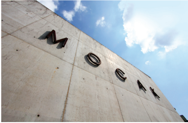
Fig. 6. MOCAK Museum of Contemporary Art on Lipowa Street, concrete "south wall" displaying the MOCAK name

Il. 6. Muzeum Sztuki Współczesnej MOCAK przy ul. Lipowej, betonowy „mur południowy” eksponujący nazwę MOCAK