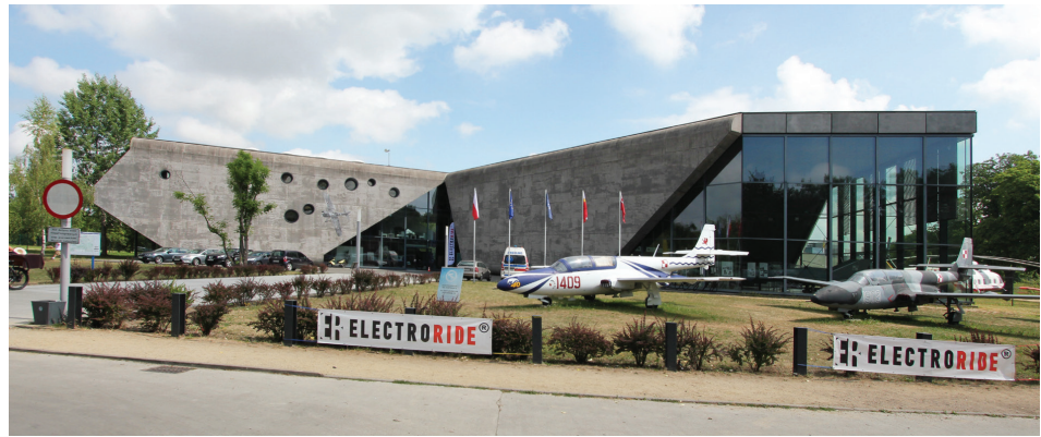
Fig. 10. Polish Aviation Museum at 39 Jana Pawła II Avenue (fot. J. Białkiewicz, 2022) Il. 10. Muzeum Lotnictwa Polskiego przy al. Jana Pawła II 39 (fot. J. Białkiewicz, 2022)