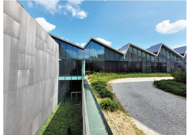
Fig. 7. MOCAK Museum of Contemporary Art on Lipowa Street with its distinctive shed roof

Il. 6. Muzeum Sztuki Współczesnej MOCAK przy ul. Lipowej, betonowy „mur południowy” eksponujący nazwę MOCAK