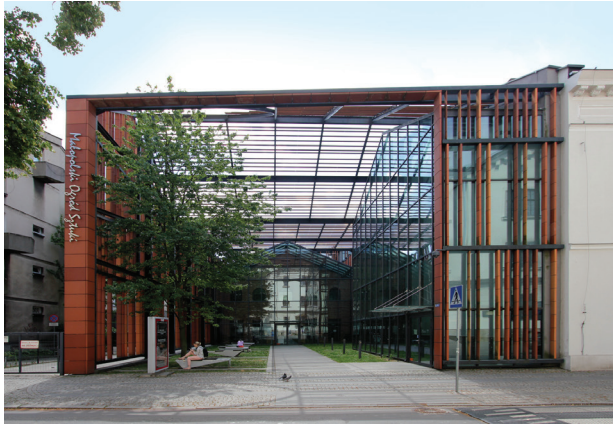
Fig. 1. Małopolska Garden of Art, view from Rajska Street

Il. 1. Małopolski Ogród Sztuki, widok od ul. Rajskiej