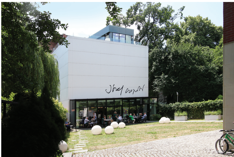
Fig. 8. Józef Czapski Pavilion in the garden of the Emeryk Hutten-Czapski Museum on J. Piłsudski Street

Il. 8. Pawilon Józefa Czapskiego w ogrodzie Muzeum im. Emeryka Hutten-Czapskiego przy ul. J. Piłsudskiego