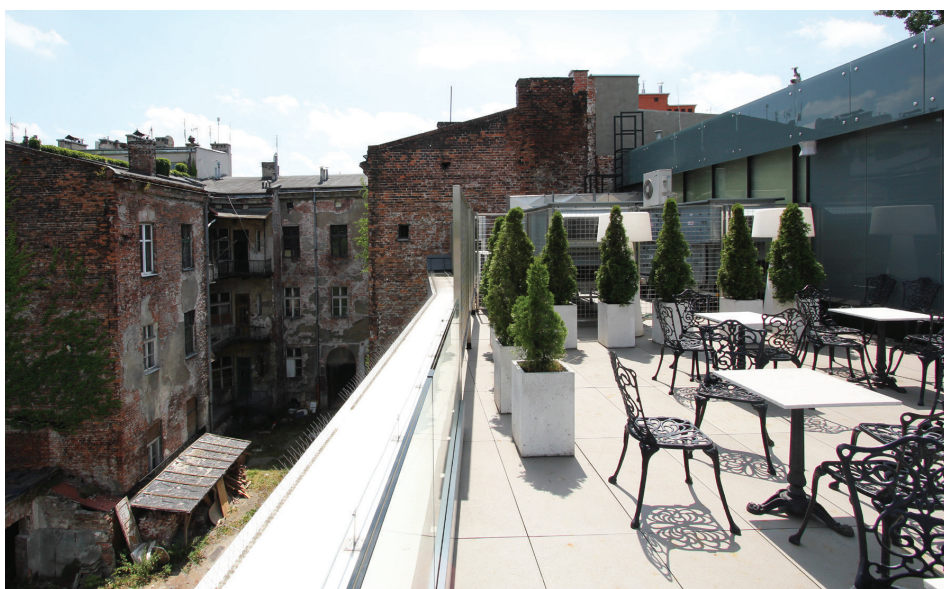
Fig. 9. View from the terrace of the Józef Czapski Pavilion (fot. J. Białkiewicz, 2022)

Il. 8. Pawilon Józefa Czapskiego w ogrodzie Muzeum im. Emeryka Hutten-Czapskiego przy ul. J. Piłsudskiego (fot. J. Białkiewicz, 2022)