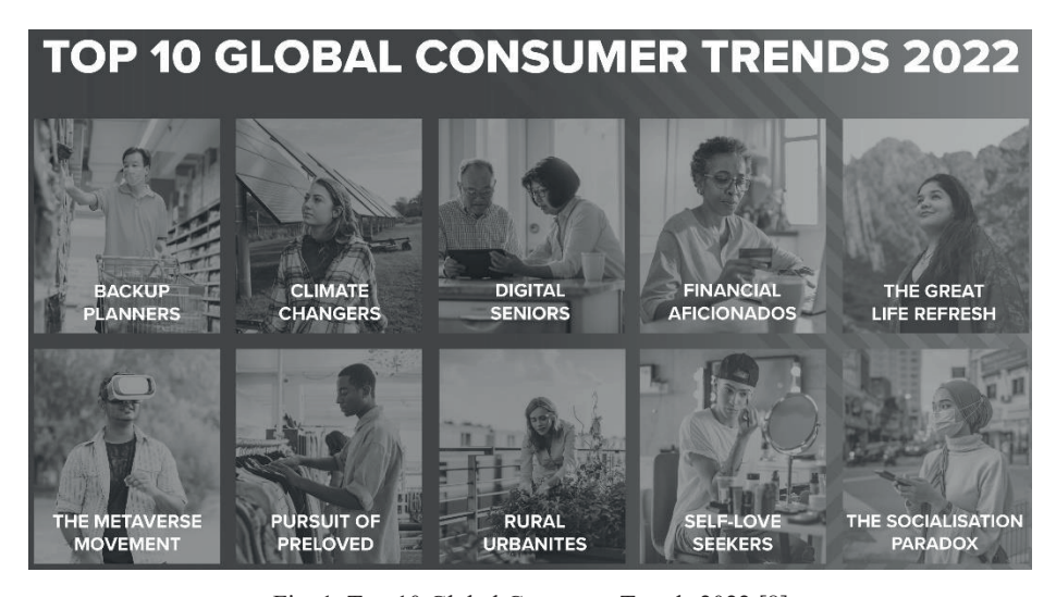
Fig. 1. Top 10 Global Consumer Trends 2022 [8]

According to the research performed by Euromonitor, released in January 2022, entitled "Top 10 Global Consumer Trends 2022", the consumers changed their minds and the values compared to the previous years (for example considering the year 2021). The factors described at the beginning of the essay turned the world