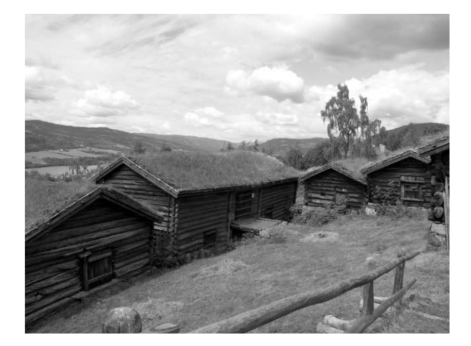
Fig. 3. Two-courtyard farm Bjørnstad in an open-air ethnographical museum Maihaugen in Lillehammer, Norway. The courtyard with farm extensions

II. 3. Gospodarstwo dwu – dziedzińcowe Bjørnstad w skansenie Maihaugen w Lillehammer, Norwegia. Dziedziniec z zabudowaniami gospodarczymi