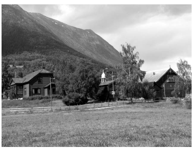
Fig. 4. Farm development with a nest arrangement in Lom, Norway

II. 4. Zabudowa farmerska o układzie gniazdowym w Lom, Norwegia