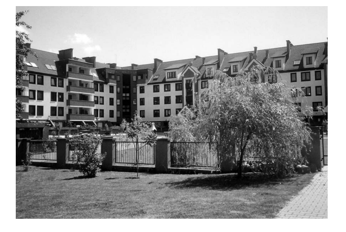
Fig. 11. Complex of multi-family development with the garden courtyard on Jaracza Street in Wrocław

Reducing the private space in favour of the common territory can also be noticed in arrangements with internal garden or walking courtyards and small, separate, private gardens within their limits. In these solutions on the external side there is only a public zone of the thoroughfare. Entrances (through ones) and small services are usually located on this side of the development. As an example we can mention the complex situated on Jaracza Street in Wrocław (architect Andrzej Miech, completed in 2000) (Fig. 11).