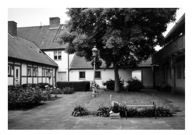
Fig. 8. Residential complex with the nest arrangement in Ystad, Sweden

A community house is an element which also appears in Dutch and Swedish group developments. It can be located within the complex as a detached building – in the development frontage and line or within the range of the internal courtyard, which closes the internal space of the