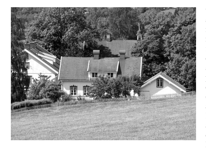
Fig. 5. Nest residential development in Lillehammer, Norway

The form of traditional Norwegian group settlements, which are built in the eastern part of the country, is designed on the basis of one or two internal courtyards. In the past, these complexes were inhabited by family communities. The 18<sup>th</sup>-century farm Bjørnstad, which is now situated in the open-air ethnographical Maihaugen museum in Lillehammer, is a classical example. The farm has a two-courtyard arrangement. Around the first one there are three houses: two seasonal ones (winter and summer) and the so called chimneyless cabin with a cen-