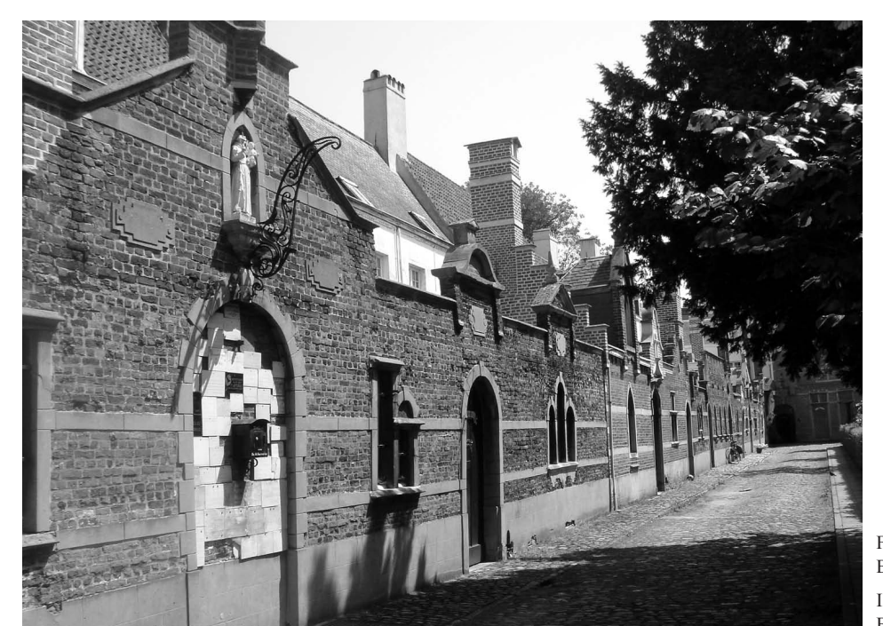
Fig. 7. Begijnhof in Antwerp, Belgium (photo: E. Cisek) Il. 7. Begijnhof w Antwerpii, Belgia (fot. E. Cisek)

the complex resembling a little city: with stone-paved streets, a church, workshops for artists and private enclosed gardens situated in different places of the development. At present, this complex is inhabited by old people and artists.