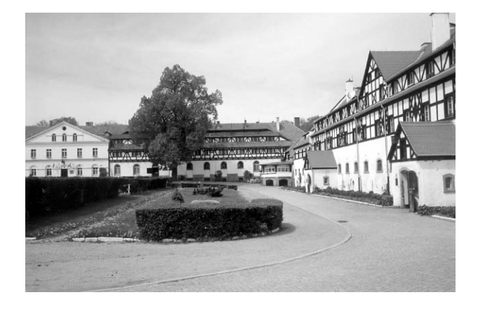
Fig. 10. Complex of old castle stables connected with the residential development in Książ

In residential complexes of Egebjergtoften and Egebjerggard III in Denmark a community house is a separate detached building situated in the close neighbourhood. In the first example, it is situated on the northern side of the residential development. It is partly located on water and constitutes a unique element in the arrangement of the whole complex. Inside the courtyards of three nests there are additional common facility rooms. A community house in Egebjerggard III was also designed as a separate building; however, it can be entered from the green interior of the complex. It constitutes a closure of the common courtyard space and at the same time it is an attracting element to which attention