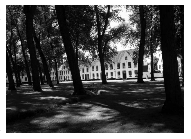
Fig. 6. Begijnhof in Brugia, Belgium Il. 6. Begijnhof w Brugi, Belgia

cosmic planes crossing – the tunnel which connected the world reality with heaven. Forms of this holy axis, which appeared in begijnhofs are as follows: a sculpture, tree – garden or chapel – begijnhofkerk .